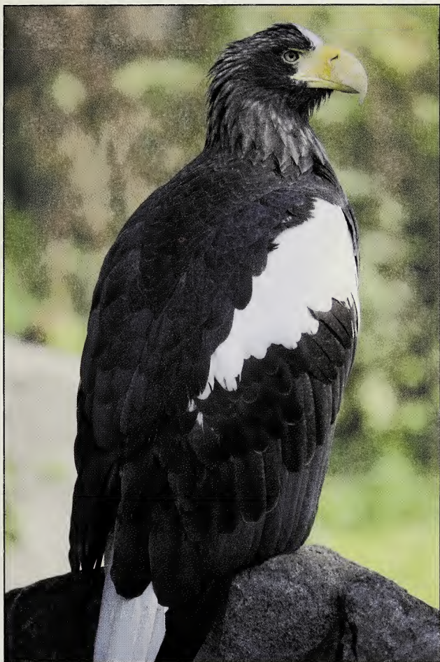
Steller's Sea Eagle at Tierpark Berlin.