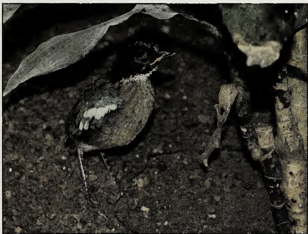
Male carrying food back to the chicks in the nest, approximately four days after they hatched.