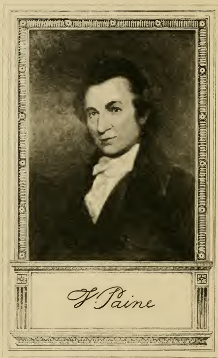
Copyright, 1896, by Small, Maynard & Company.