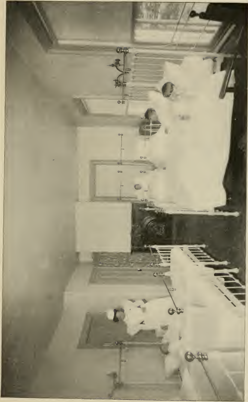
ONE OF THE WARDS.