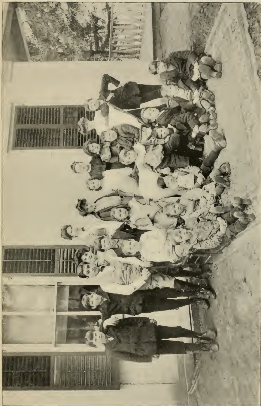
A GROUP OF PATIENTS.