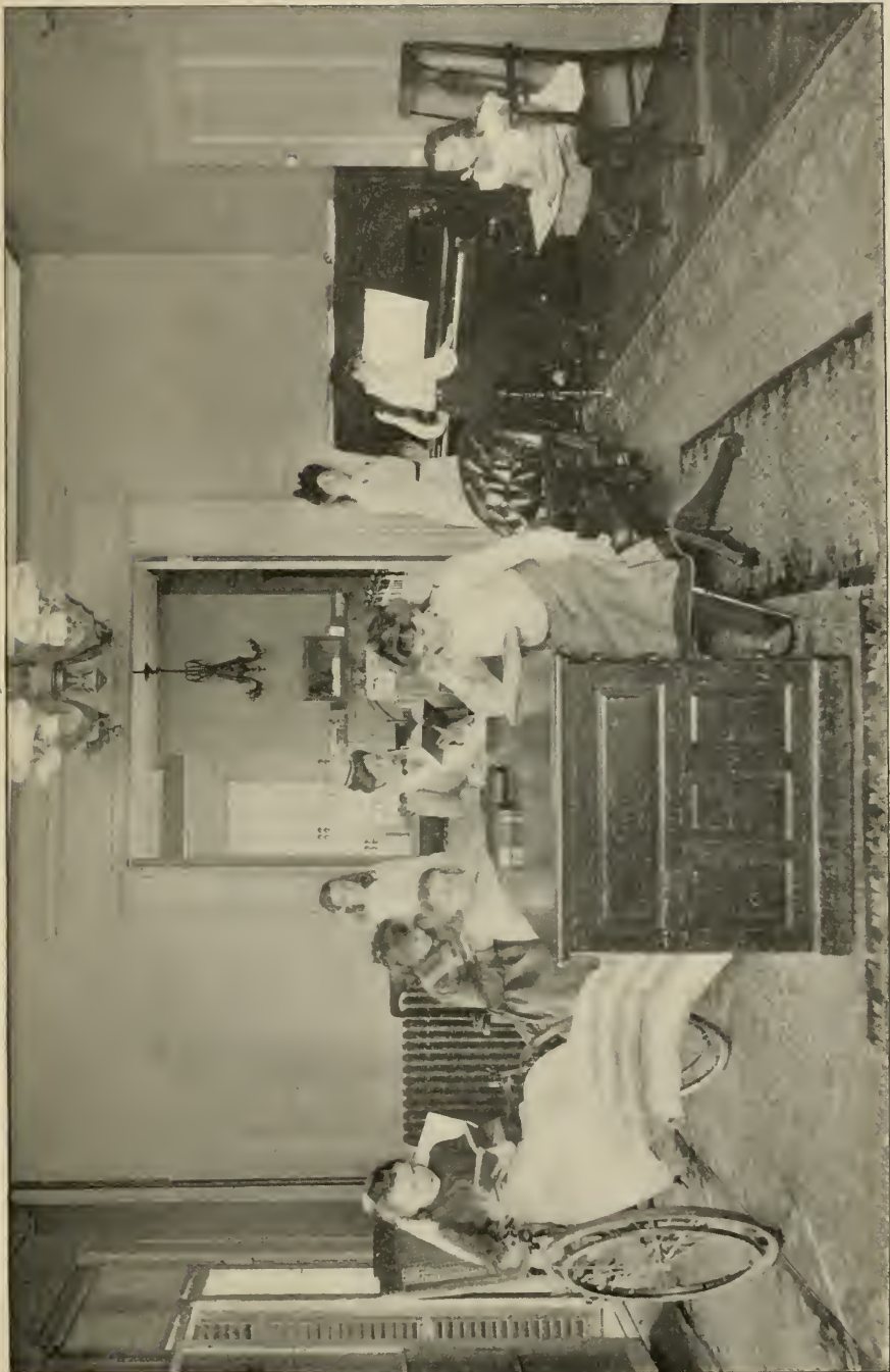
IN THE SITTING ROOM.