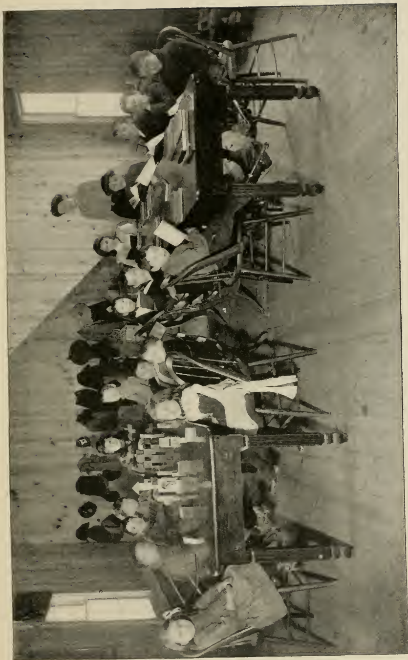
AT SCHOOL. On the left side are the Kindergarten scholars, on the right the more advanced students.