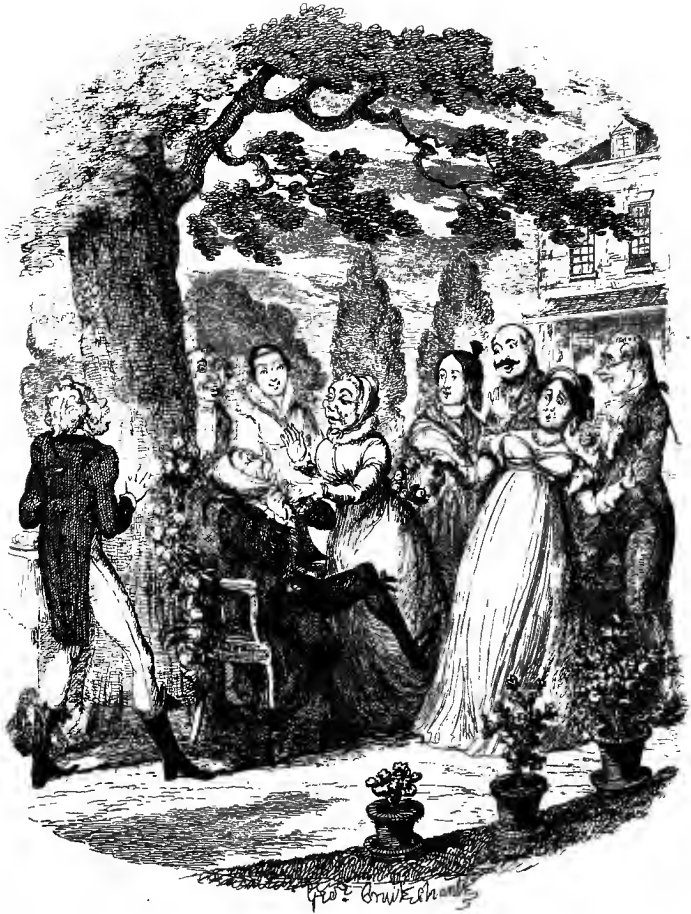
Putting an Extinguisher on Matrimony