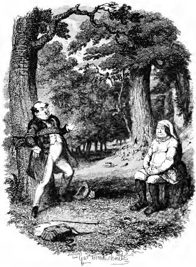
A Night in the Forest of Arden.