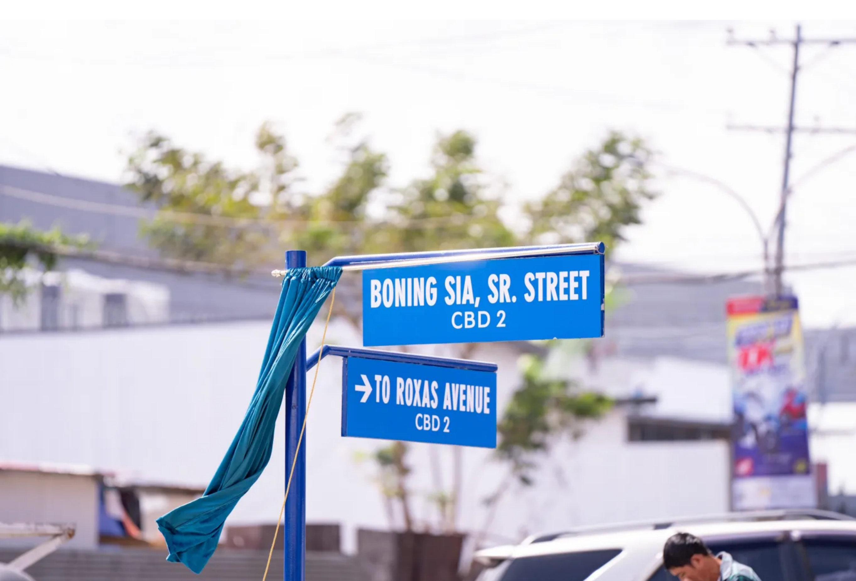
Taken during the Unveiling Ceremony of the Boning Sia, Sr. Street Sign at Bray, Triangulo, Naga City last March 15, 2024.

Tags: arts and culture, Boning Sia Sr. Street, City Government of Naga