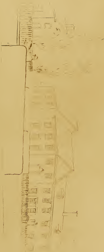
St. Peter's Basilica - Cathedral and Dome by Henry in 1801.