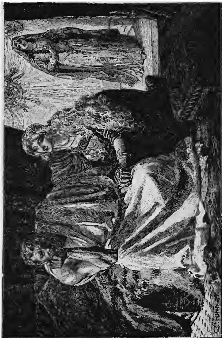
BERENGARIA INTERCEDING FOR SIR KENNETH.