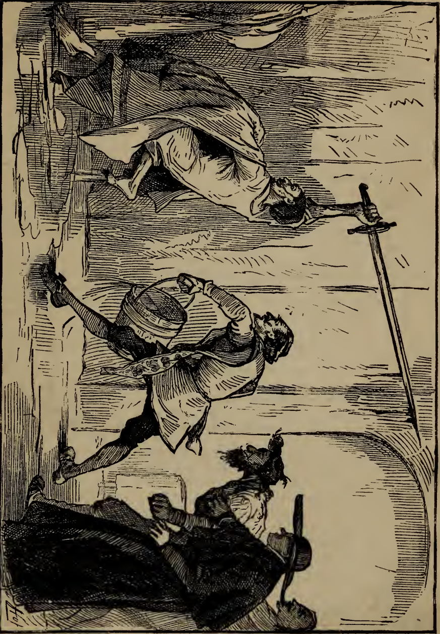
The Barber cools the ardor of the victorious Don Quixote.—Page 194.