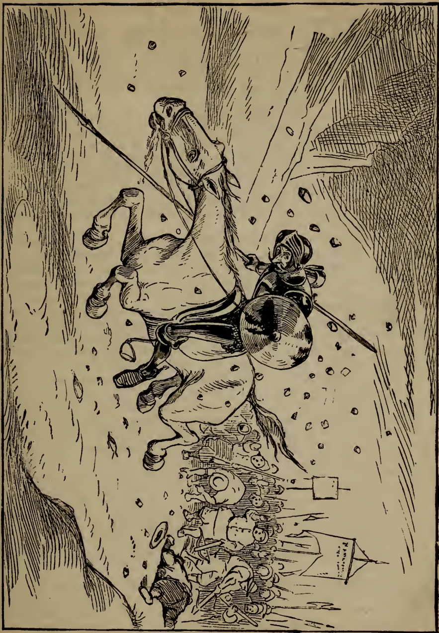
Don Quixote in a shower.—PAGE 402.