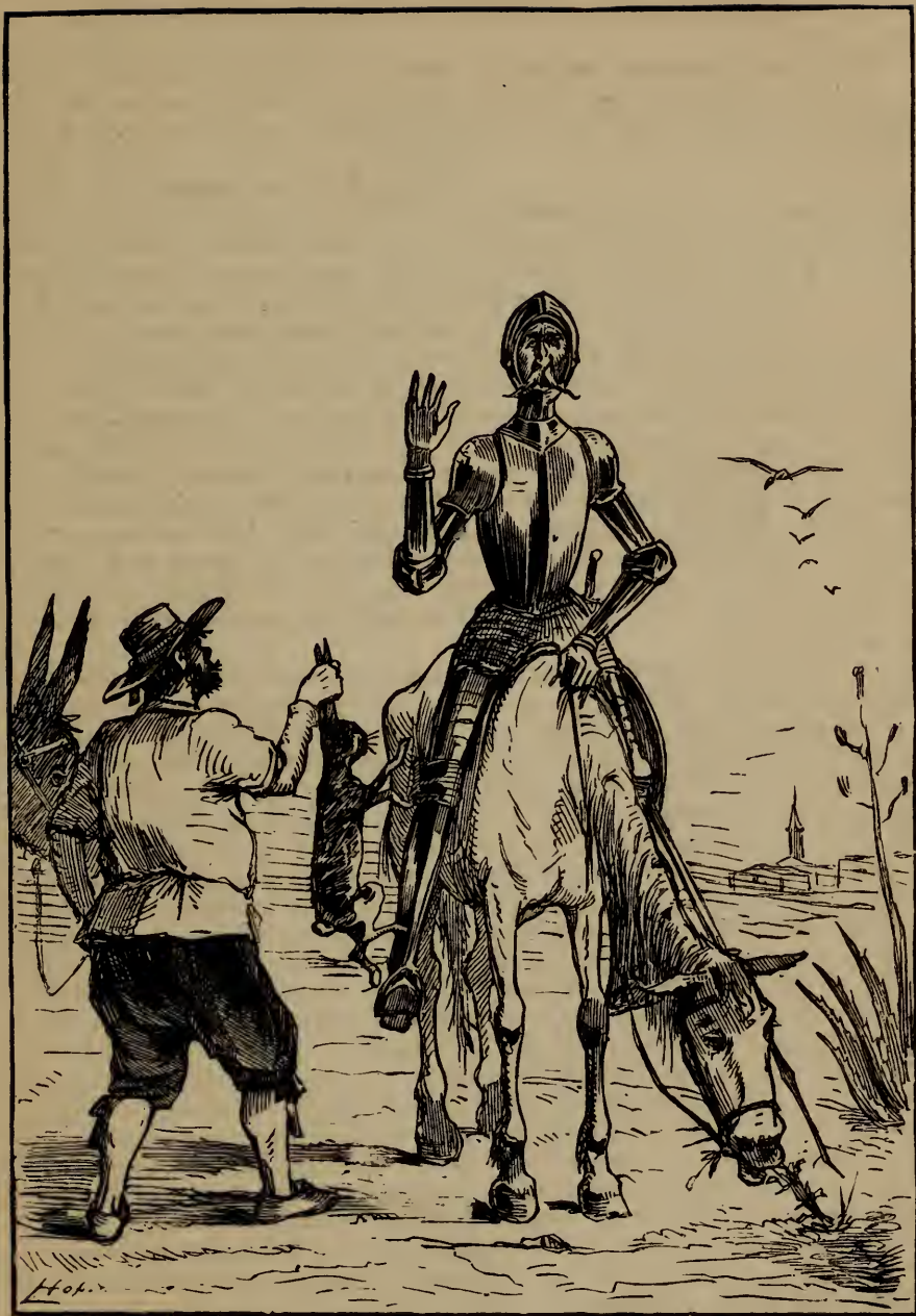
"An ill omen!"—PAGE 603.