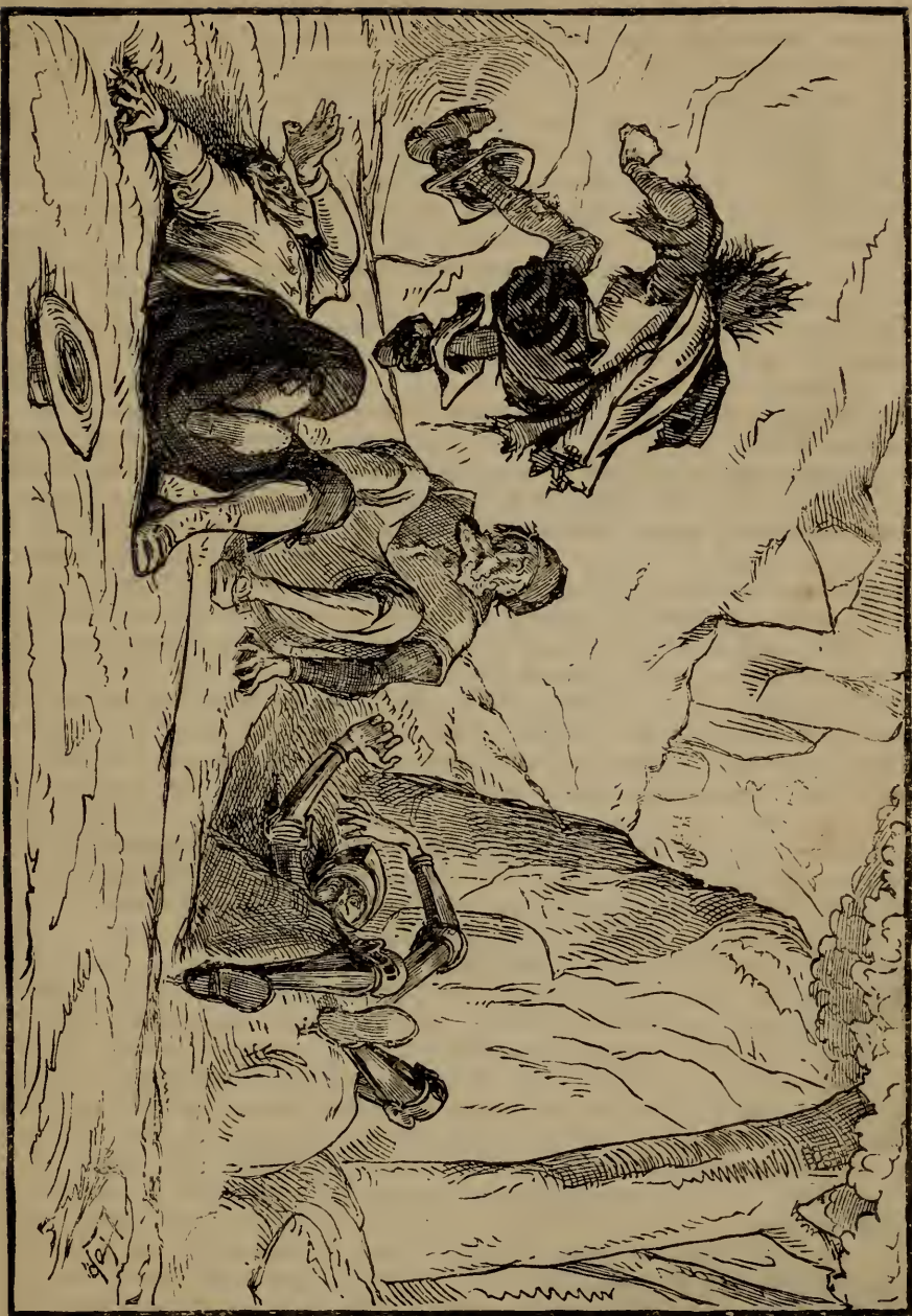
Unexpected conduct of the Tattered Knight.—PAGE 117.