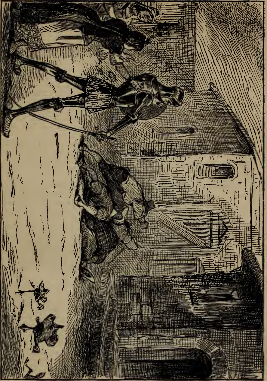
Foemen unworthy of Don Quixote's steel.—Page 258.