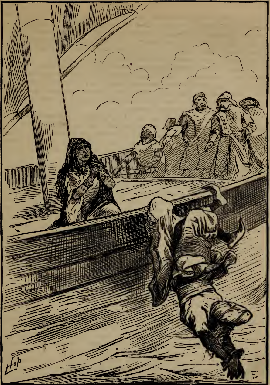
The Moor threw himself headlong into the sea.—PAGE 237.