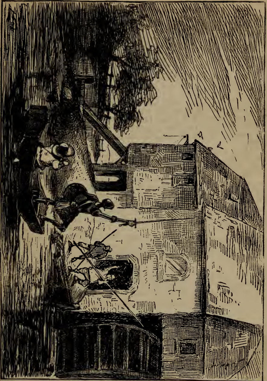
The Enchanted Bark.—Page 409.