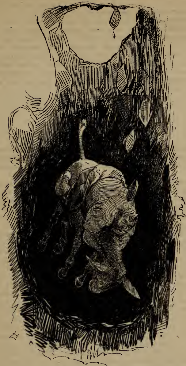
Downfall of Governor Sancho Panza.—PAGE 523.