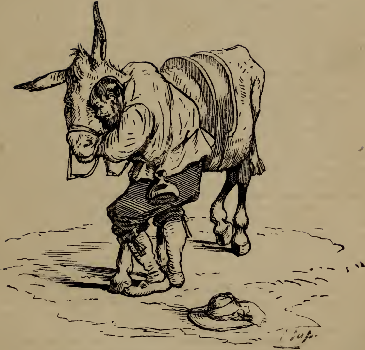
Reunion of hearts long severed.—PAGE 157.