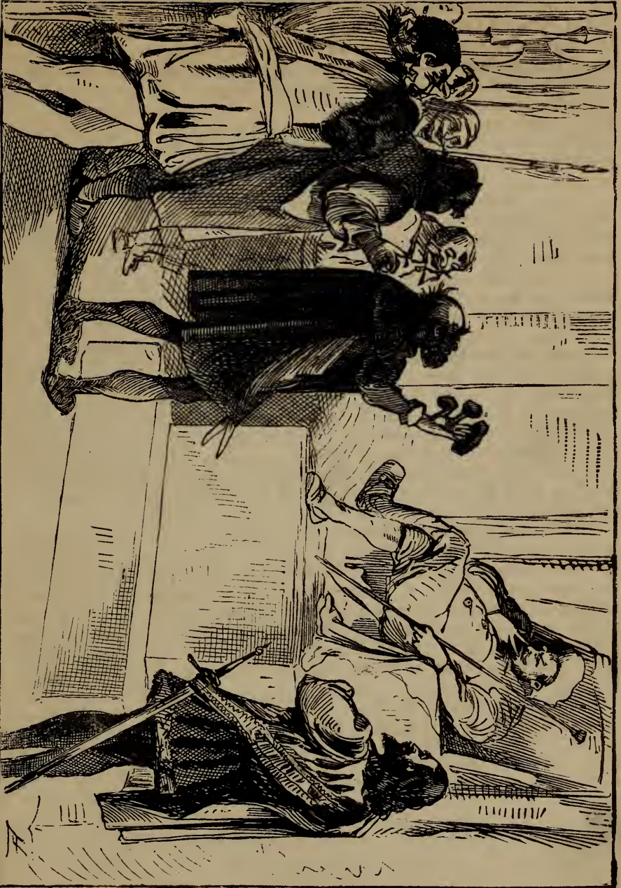
The Court of Sancho Panza.—Page 474.