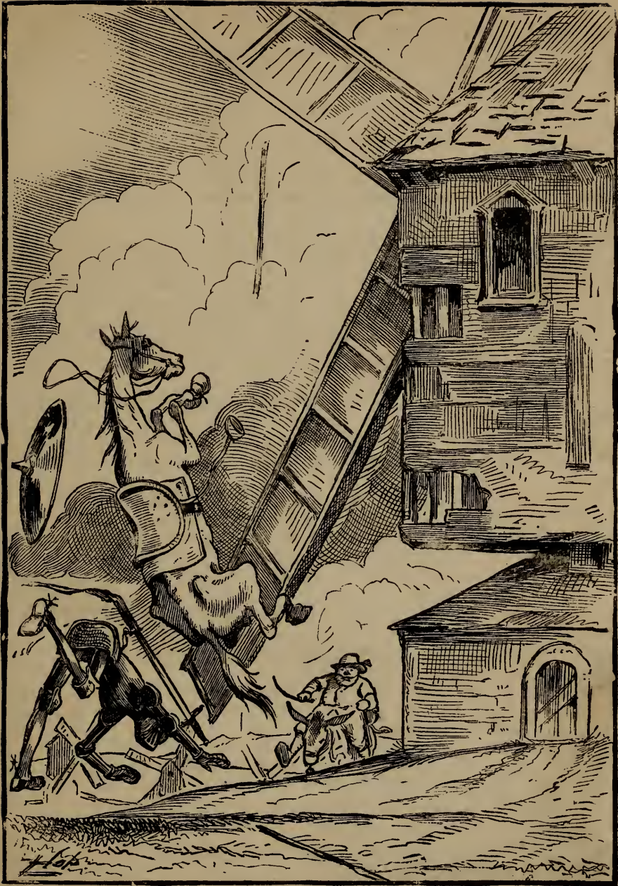
The Victorious Windmill.—PAGE 40.