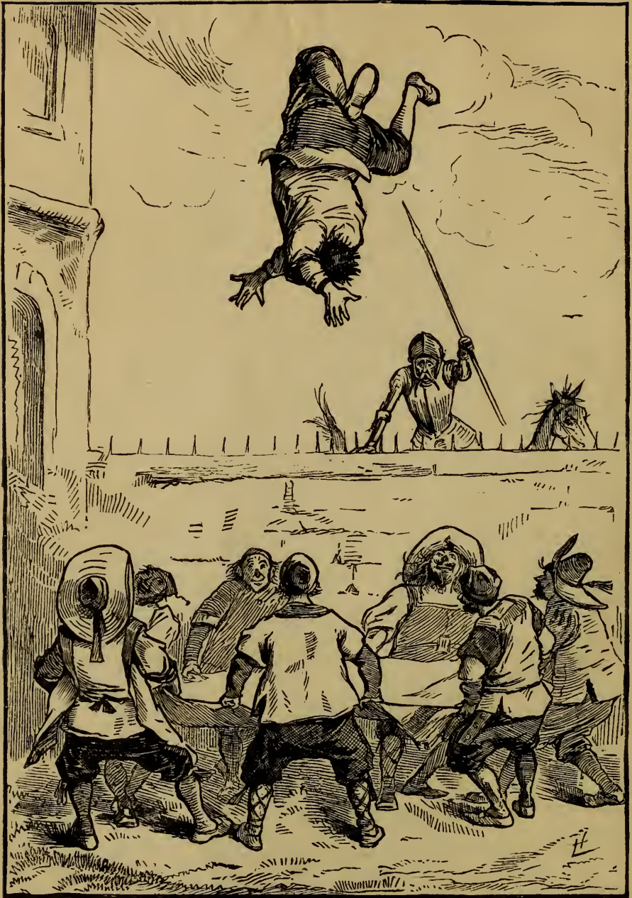
Sancho Panza experiences many ups and downs.—PAGE 75.