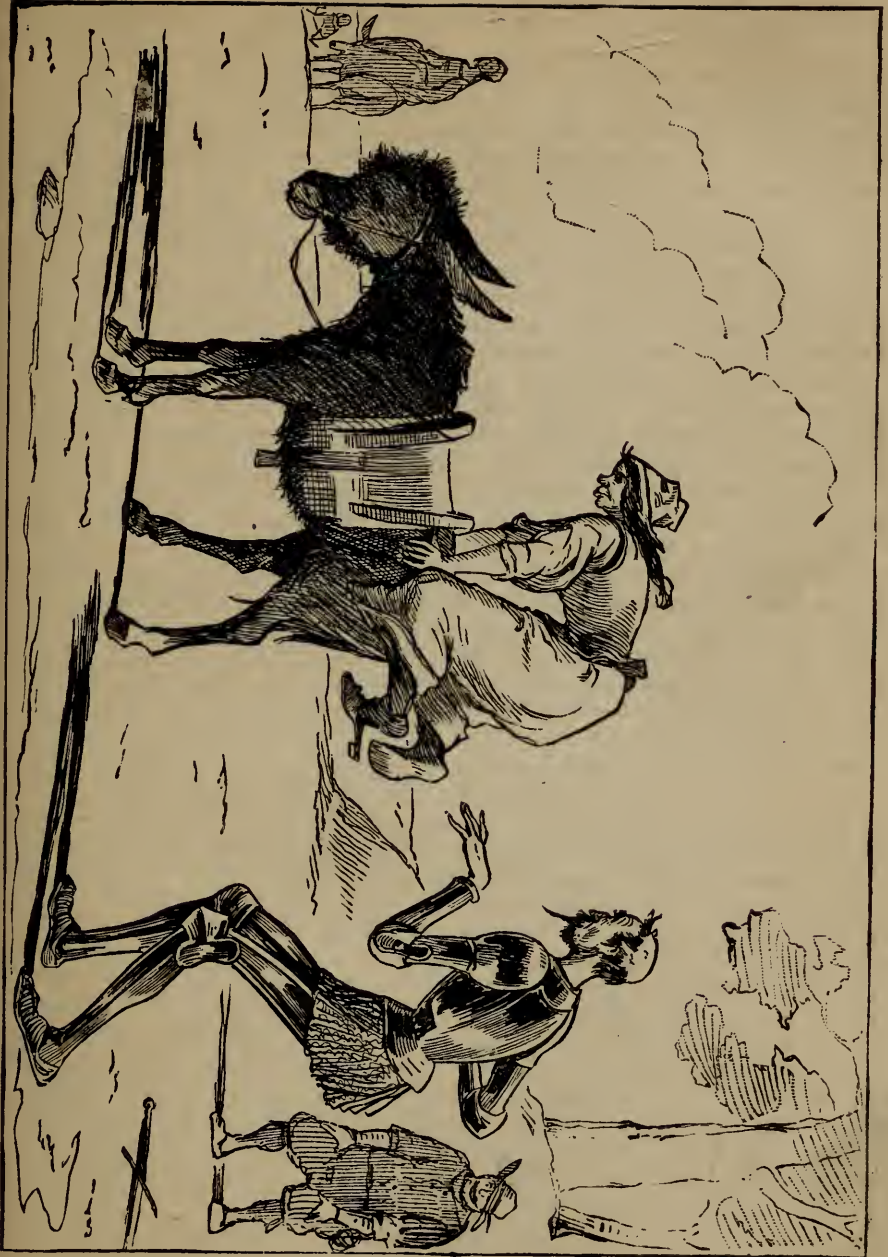
Dulcinea mounts in a singularly enchanted way.—Page 322.