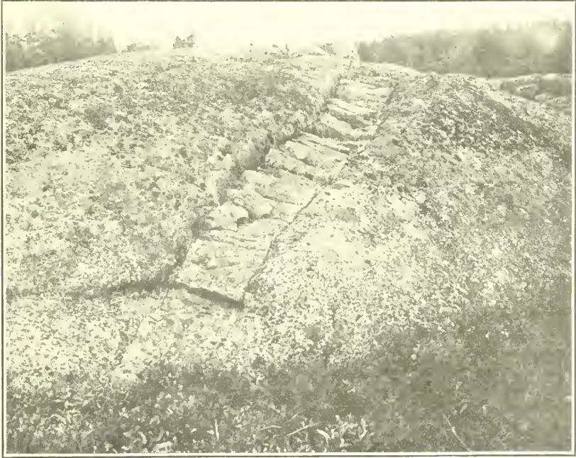
Pegmatite dike filling a rift in the granite of Pemetic Mountain.

Although the noble granitic rocks that form this range rest quiet and cold in their age to-day, they were once hot and energetic, pressing their way upward, as a vast molten mass, toward—and overflowing possibly—the ancient surface of the land. The massive granite stretches east and west across the island, inclosed wherever the attack of ice or sea has failed to lay it bare by rocks of a wholly different origin and character. At first these other rocks are seen as isolated fragments included in the granite; the fragments then become more frequent until