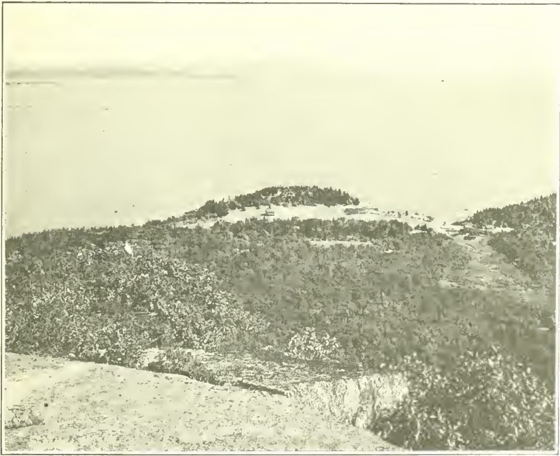
Schooner Head and the entrance to Frenchmans Bay seen from the summit of a splendid cliff. The sea horizon from this point lies over 30 miles away.

MOUNT Desert Island has an area of over one hundred square miles. The ocean surges against it on the south; broad bays enclose it on the east and west, and at its northernmost extremity a narrow passage only separates it from the mainland. Its outline is very irregular, like that of the Maine coast in general, with harbors and indentations everywhere. The largest of these, Somes Sound, a long, deep fiord running far into the land between mountainous shores, nearly bisects the island. There are some 13 mountains—bare rocky summits varying in