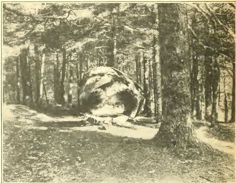
Glacial boulder in a forested mountain valley 700 feet above the sea.

The forests of Mount Desert Island were once full of wealth, and full of wealth they still would be if the lumbermen had not done their work so well. High up on the mountain sides, through the mountain gorges, along the borders of the lakes and streams, everywhere to the water's edge, the great trees growing on the thin but rich wood-soil were taken out, as one may plainly see by their huge rotting stumps to-day. The importance of preserving the woods which still remain no lover of Nature can question. They are infinitely precious as a part of the wild