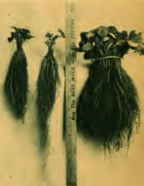
Roots 12 to 18 Inches

What we call a good fruitful or productive plant is a plant that has been bred right from the start. Selected from a strain that has proved to be fruitful. Grown on new virgin soil with plenty humus to feed it throughout the growing season. Grown in a climate where it had