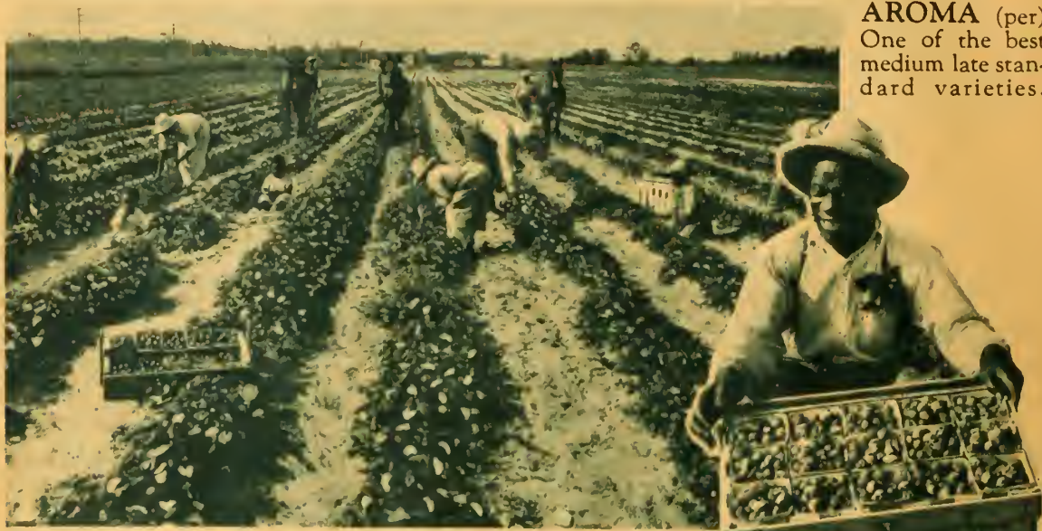
Picking and Cultivating Mastodon OCTOBER SCENE on Townsend's Plant Farms

AROMA (per) One of the best medium late standard varieties.