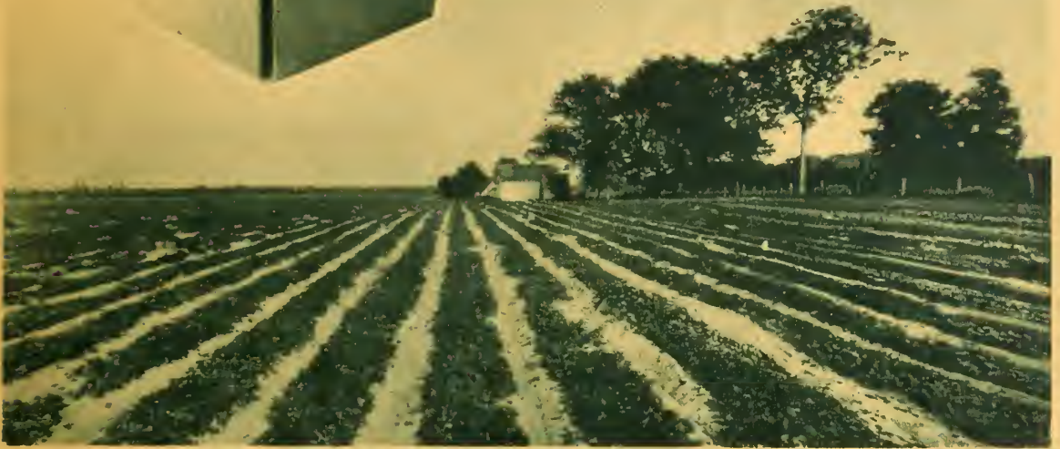
More than 100 Acres in this Field of New Ground Plants

Glen Mary (per) Glen Mary is fast losing