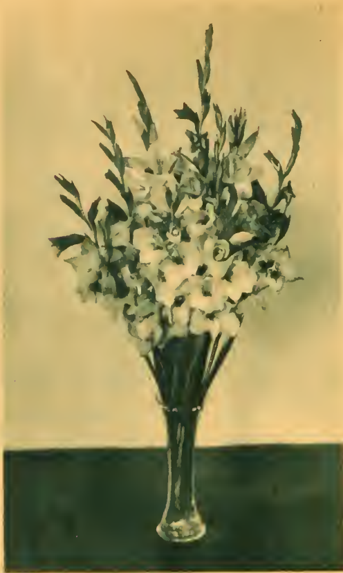
25 GLADS $1.25 Postpaid