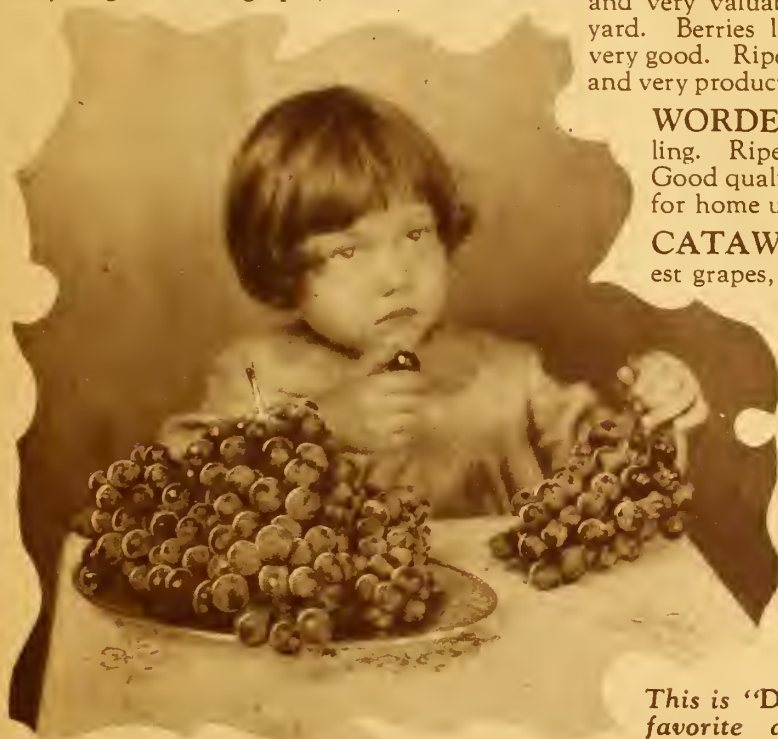
This is "DOTT DEAN" and her favorite dish of CONCORDS

CACO —Red. The average person can tell no difference between this and Catawba. It is a highly advertised grape, and we have paid a big sum to get in stock, but do not believe it any more valuable than the standard red grapes.