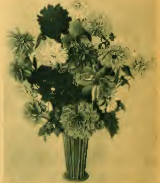
DAHLIA RAINBOW COLLECTION