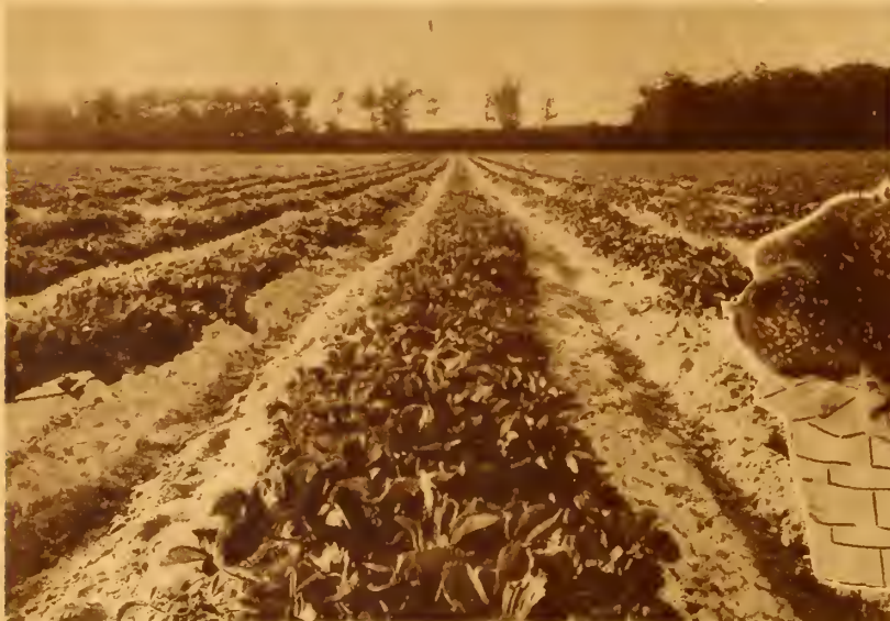
50 ACRE FIELD of PREMIER Photo Sept. 1st

LORD-SALISBURY (per) This variety was introduced by us three years ago under our guarantee that it prove as represented or money would be refunded. We sent Lord Salisbury in to practically every state and have never been asked to return a penny. But have received many good reports from all sections and especially the South. This variety begins to ripen very early and continues to fruit over a long time. Fruit of the Klondyke shape and appearance more firmer than Klondyke, and will yield much more fruit under same conditions. Eating quality very mild and sweet, one of the most hardy plants grown. And a variety sure to please the commercial growers, especially in the