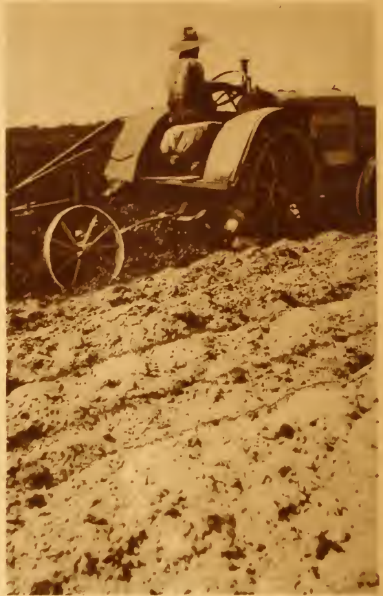
Plowing Under Tons of Humus Keeping Our Soil Rich

Mr. McCloskey of Pa. writes us again— We have just finished picking our crop of berries. We could never hope to have finer crop and prices were good. We use just as much pains in picking and packing our berries as we do in growing them. We stamp our name on every box and try to make every box just the same. We were getting 30 cents per quart when our neighbors were getting only half that much and theirs went dragging while we had to turn down orders. We never plant anything but Townsend's plants and always recommend them to our friends.