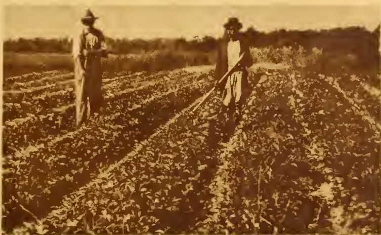
Townsends Plants in New England

Our present crop is more than 20 millions of plants of this grand variety.