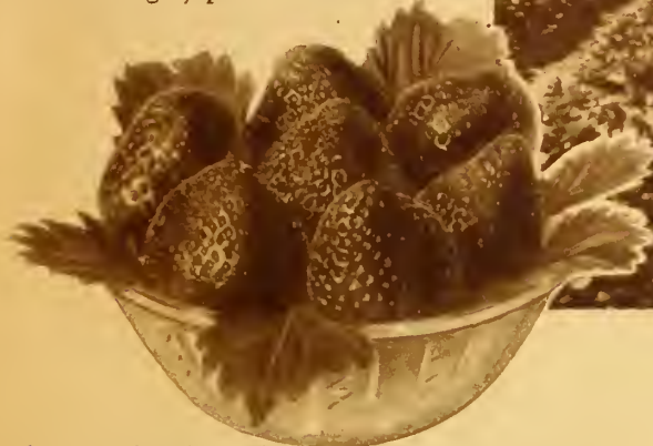
FORD, The Universal Strawberry

other in Florida and other Southern states. A strong, hardy grower, and very productive of medium to extra large firm bright red berries with excellent quality.