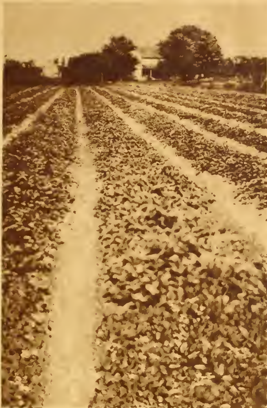
A Field of "TOWNKING" and "MAY QUEEN"

WORLDS WONDER (per) Worlds Wonder has gone unchallenged for years as the largest berry grown. Frankly it is too large to be pretty. Very mild in flavor and a great favorite among market gardeners and home gardens. A wonderful product, takes but a few plants to furnish a large family with all the berries they can use. Will grow anywhere strawberries will grow.