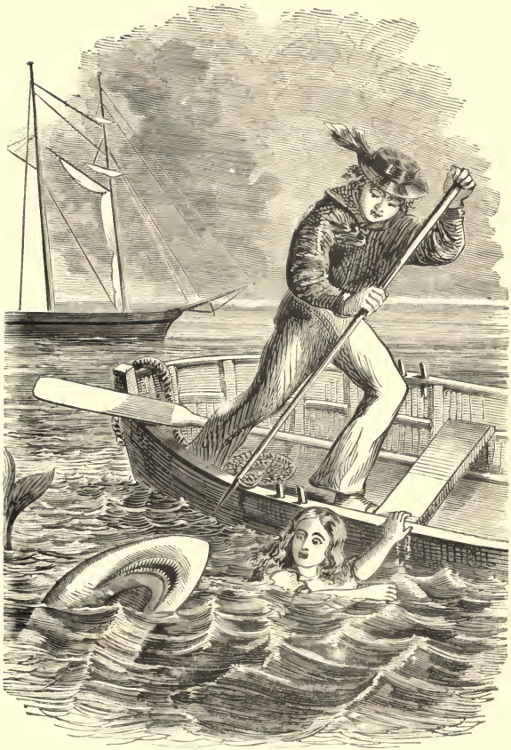
THE DECISIVE MOMENT. — Page 177.