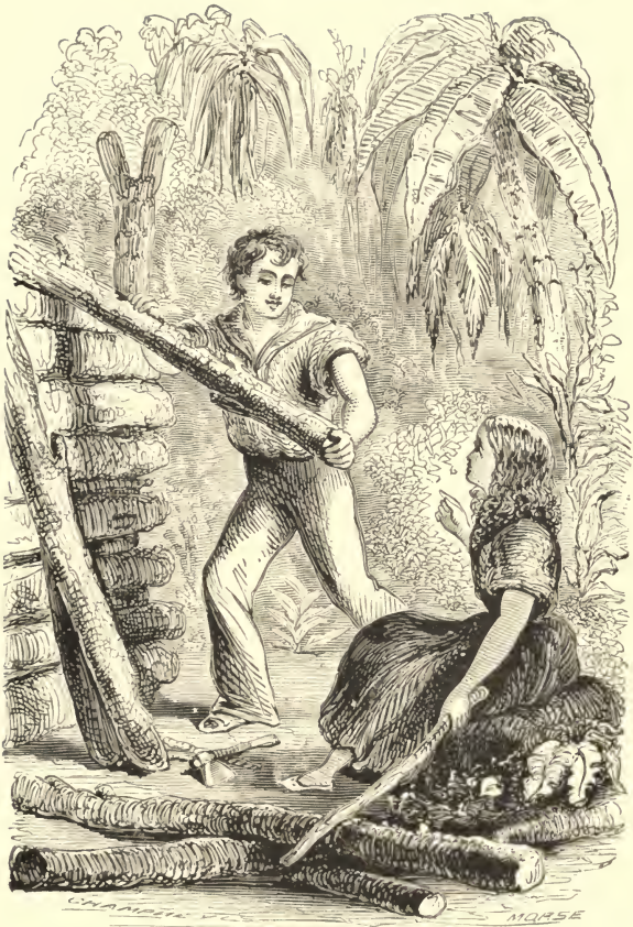
THE MANSION ON THE ISLAND. — Page 251.