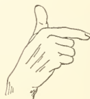
L—Thumb vertical, forefinger horizontal, others closed, edge outward.