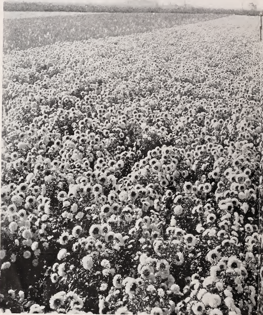
GROWING NEAR Note size and