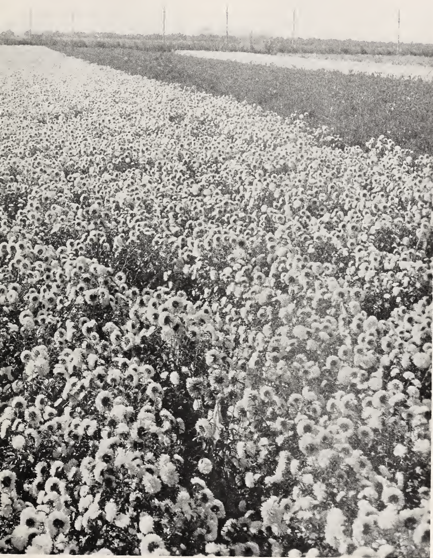
LOS ANGELES doubleness