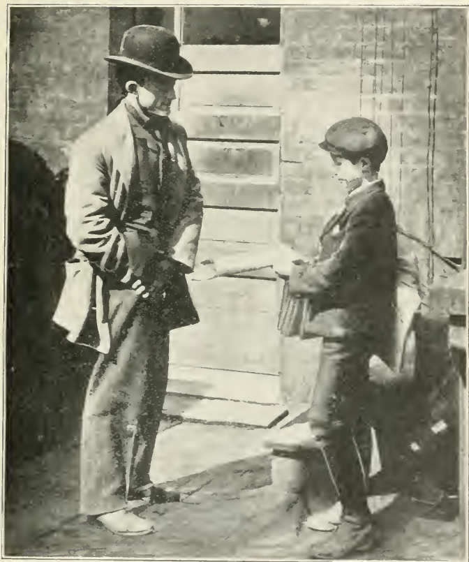
FIRST SALE OF THE DAY.