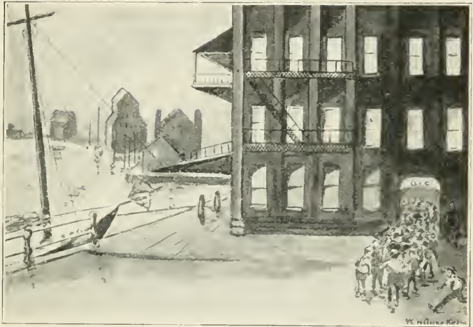
WHERE THE BOYVILLE NEWSBOYS' ASSOCIATION WAS ORGANIZED, DECEMBER 25, 1892.