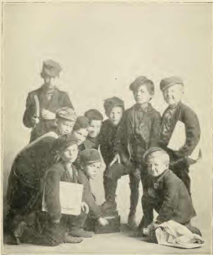
THE ORIGINAL CHARTER MEMBERS.