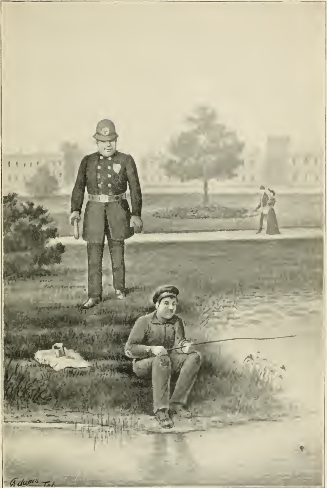
“ HE WAS FISHING IN THE LAKE.”