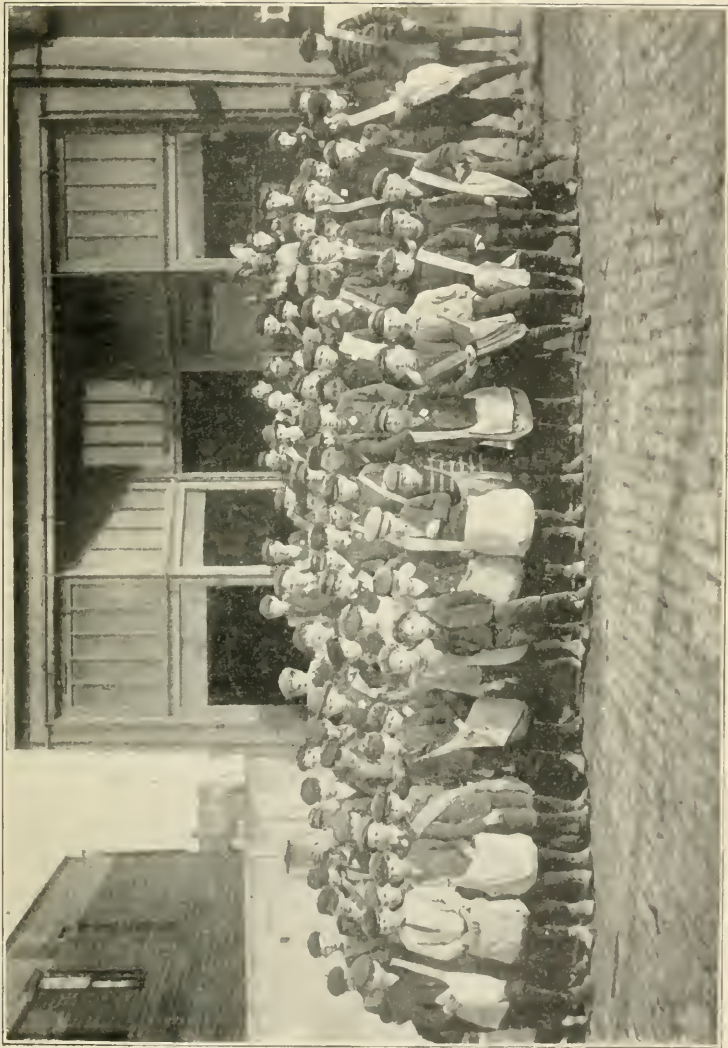
MEMBERS OF THE EAST SIDE AUXILIARY.