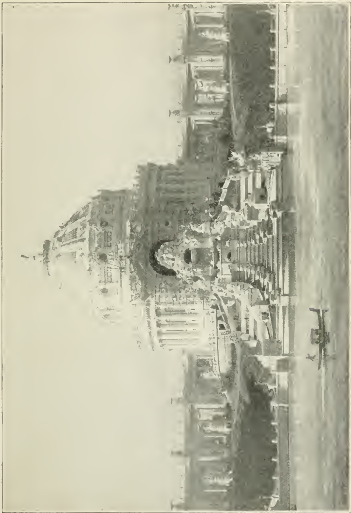
FESTIVAL HALL. WHERE THE NATIONAL NEWSBOYS' ASSOCIATION WAS ORGANIZED, AUGUST 16, 1904.