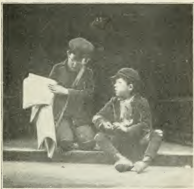
GETTING FAMILIAR WITH THE HEADLINES.