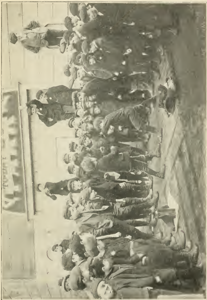
PASTIME —THE BEGINNING.