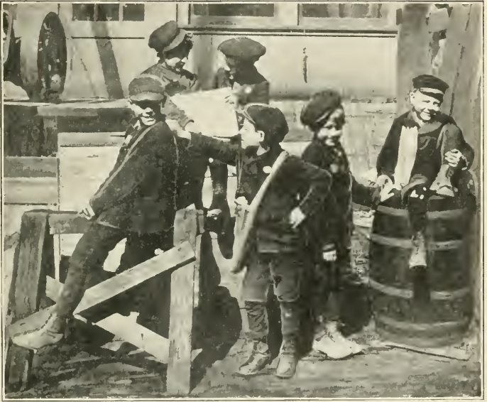
WAITING FOR THE LAST EDITION.