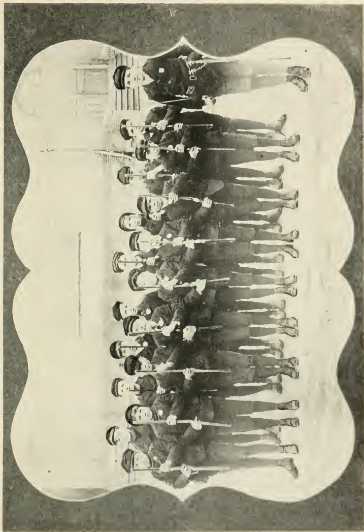
THE BOYVILLE CADETS—WHEN FIRST ORGANIZED.