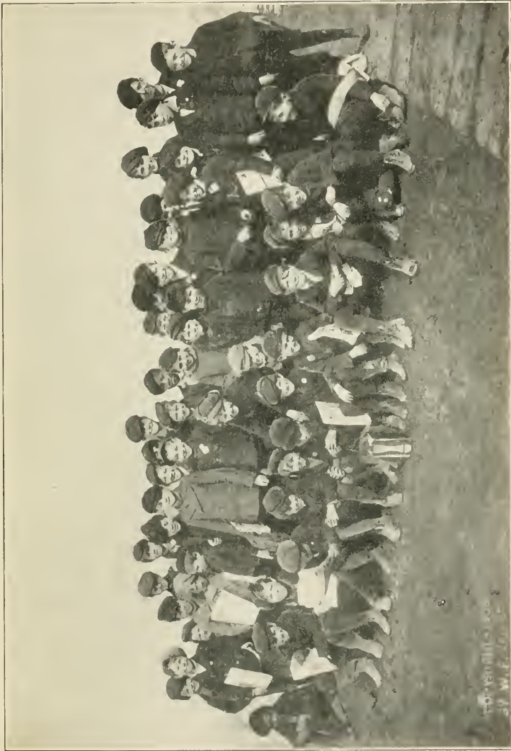
A BUNCH OF SELLERS.