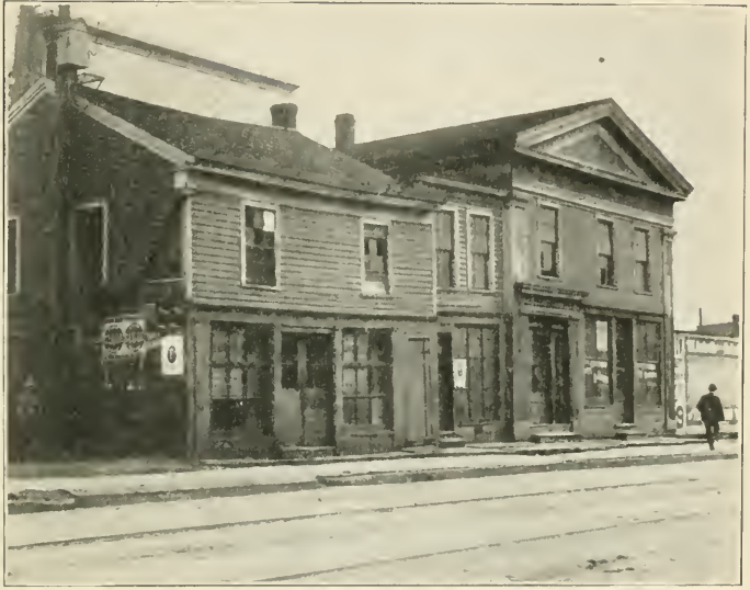
“TENEMENTS ON THE AVENUE.” IN THESE OLD BUILDINGS, AT ONE TIME, LIVED SEVENTEEN FAMILIES.