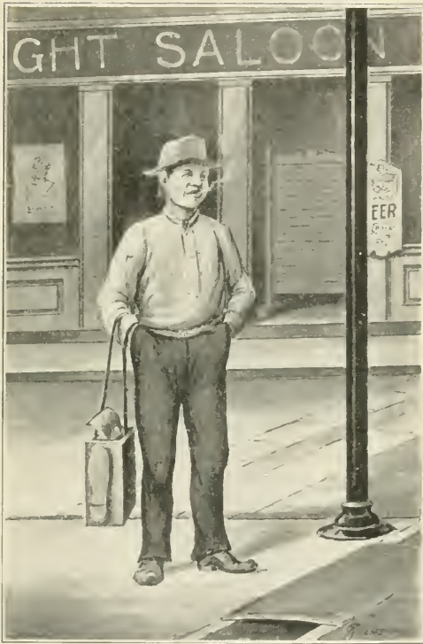
THE TOUGH FROM MARKET SPACE.