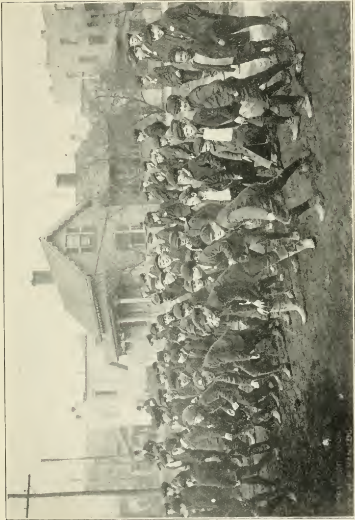
READY TO START FOR THE FIRST CHRISTMAS DINNER.