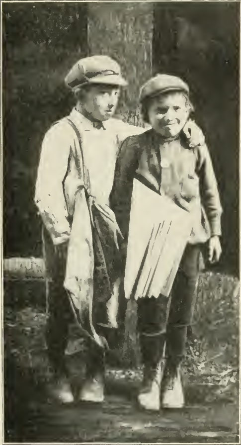
TWO NEW MEMBERS.