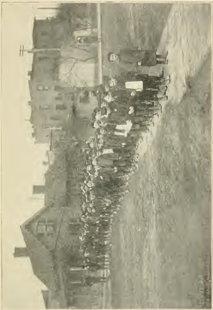
LINING UP READY TO GO TO CHURCH.