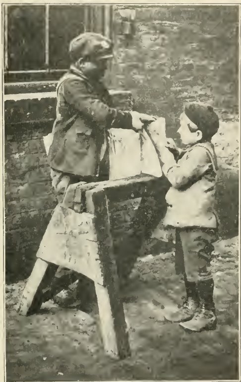
DIVIDING THE PAPERS.