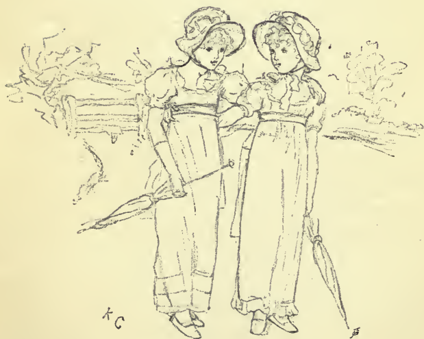
PENCIL-SKETCHES BY MISS GREENAWAY (NO. 1).