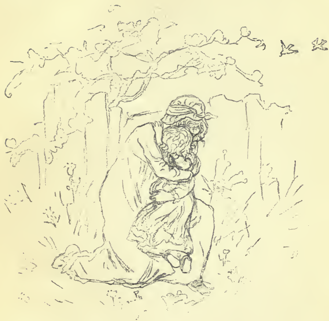
PENCIL-SKETCH BY MISS GREENAWAY (NO. 4).