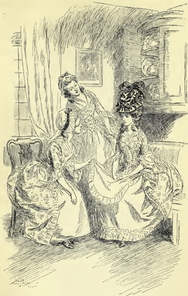
EVELINA AND THE BRANGHTONS.