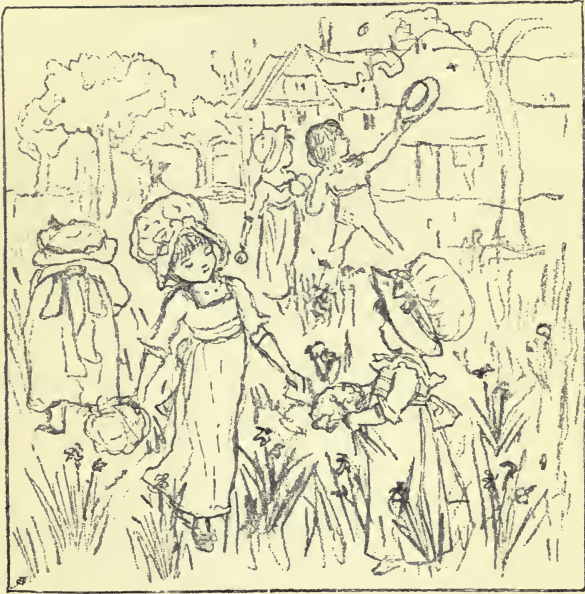
PENCIL-SKETCH BY MISS GREENAWAY (NO. 2).