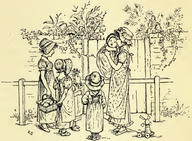
GROUP OF CHILDREN, FOR "THE LIBRARY."