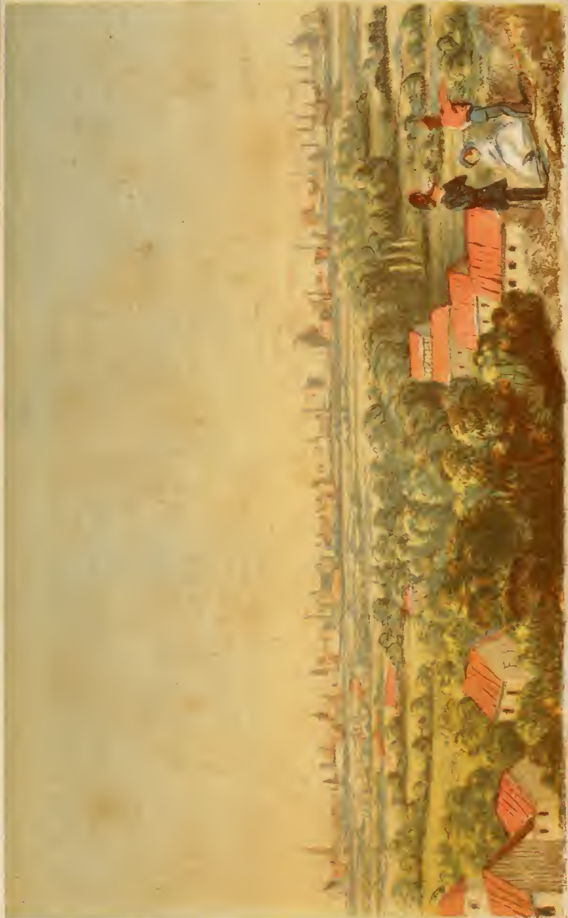
Charleston S. C. No. 21