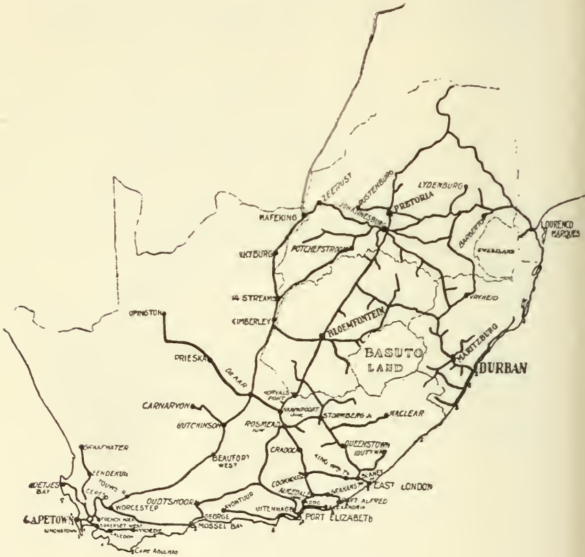
SOUTH AFRICAN RAILWAY SYSTEM

waste of the people's money and resources in building two sets of roads to the same centres.