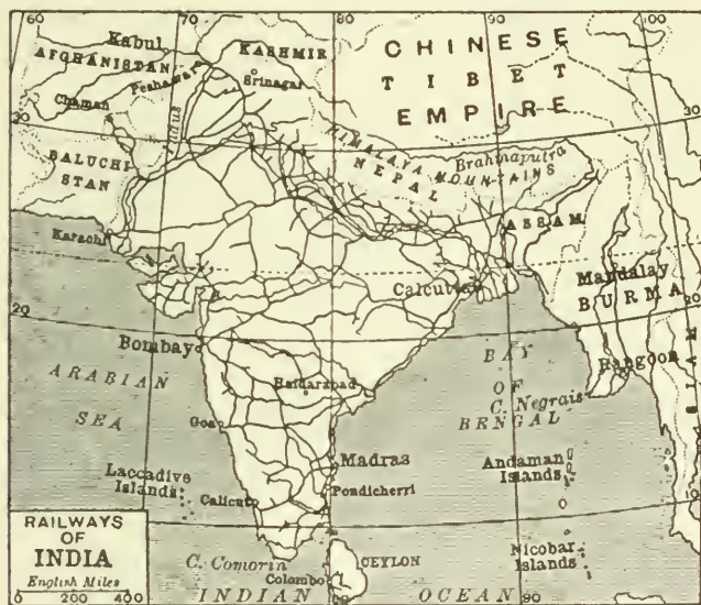
FROM HARMSWORTH'S CYCLOPEDIA

India is veined with railways, and though the veins are closely interlaced in the north, this is because of the density of population and productiveness of that area. The motive in railway planning in India is the greatest service to the whole country, and here, as in Australia, New Zealand, and South Africa, there is no waste of land and money in