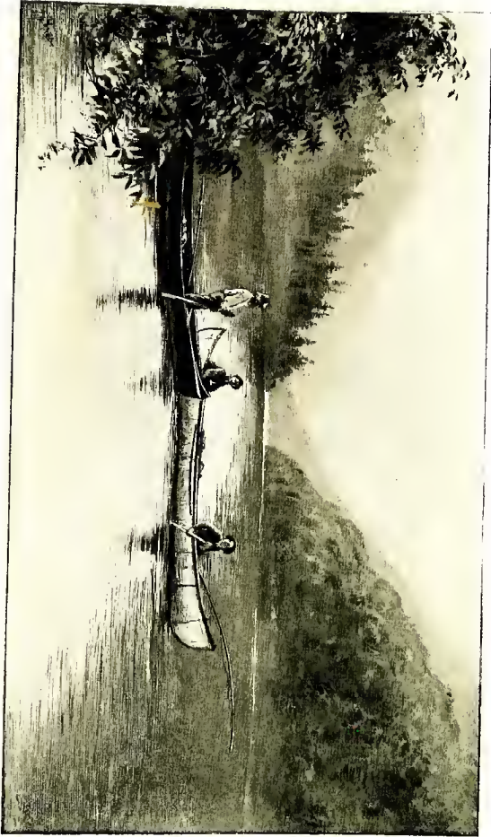
ON THE JACQUES-CARTIER