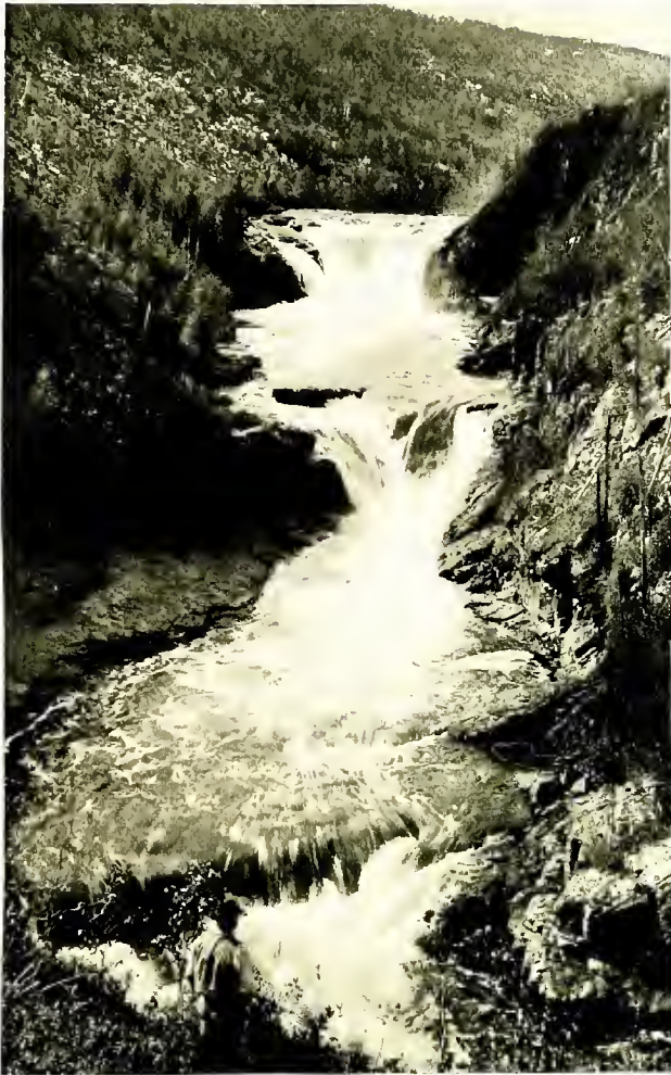
FALLS OF THE METABETCHOUAN