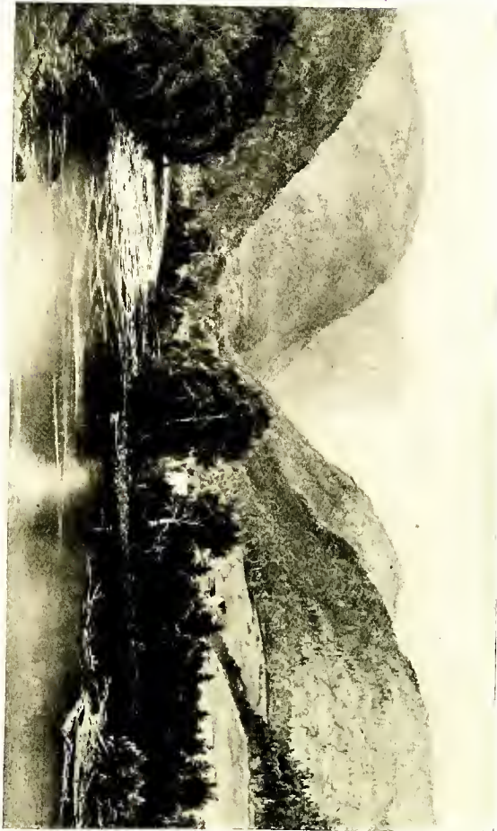
THE LITTLE SAGUENAY NEAR ST. RAYMOND