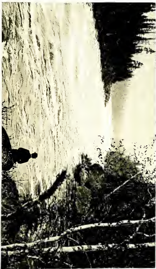
CASCADE OF THE PERIBONCA