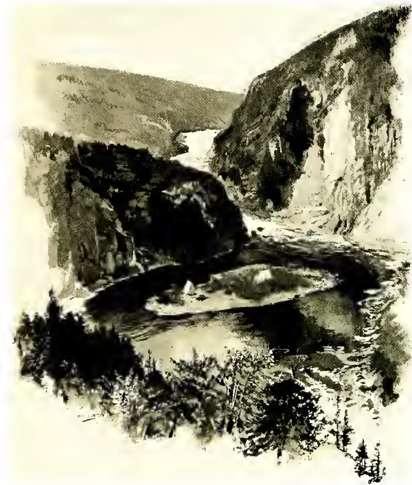
A POOL OF THE METABETCHOUAN RIVER