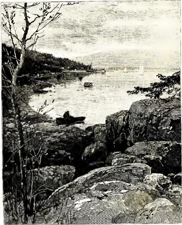
A CORNER OF LAKE ST. JOHN