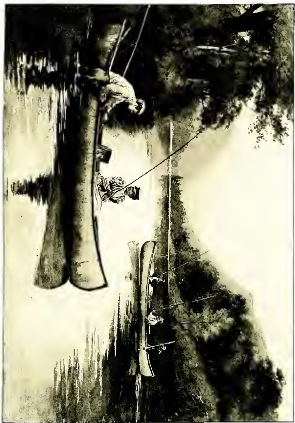
IN THE LAURENTIDES NATIONAL PARK