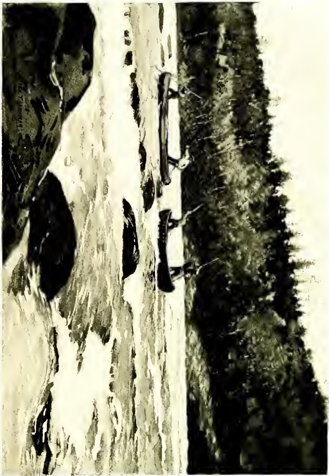
POLING UP THE CHIGOGICHE RIVER