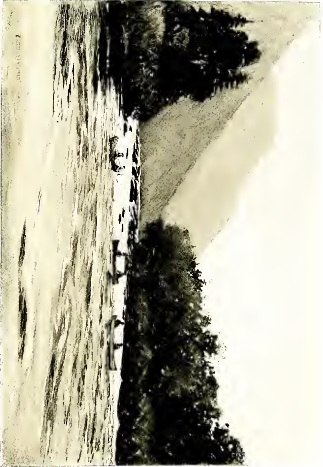
A SCENE IN "NATURE'S GREAT FISH PRESERVE"