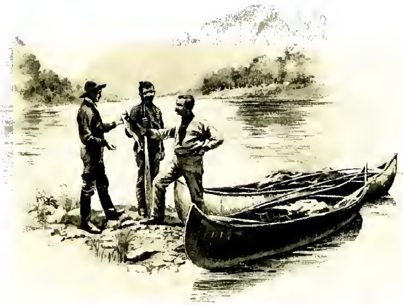
JACQUES-CARTIER RIVER TROUT