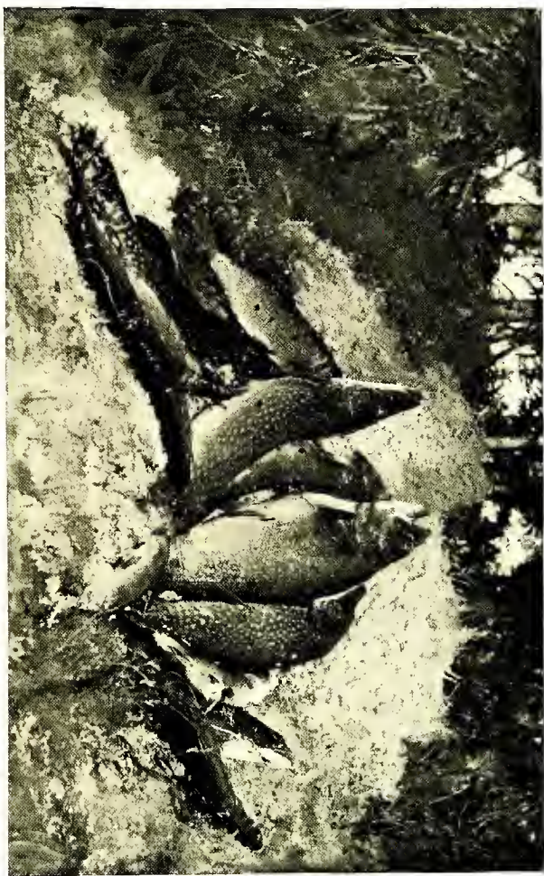
CATCH OF A SMALL NET ABOVE THE GREAT FALLS OF THE HAMILTON