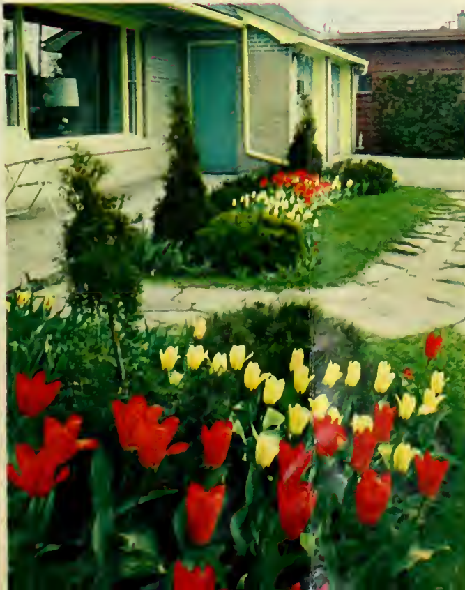
By moving your garden up front you can say „Welcome“ to all your guests.