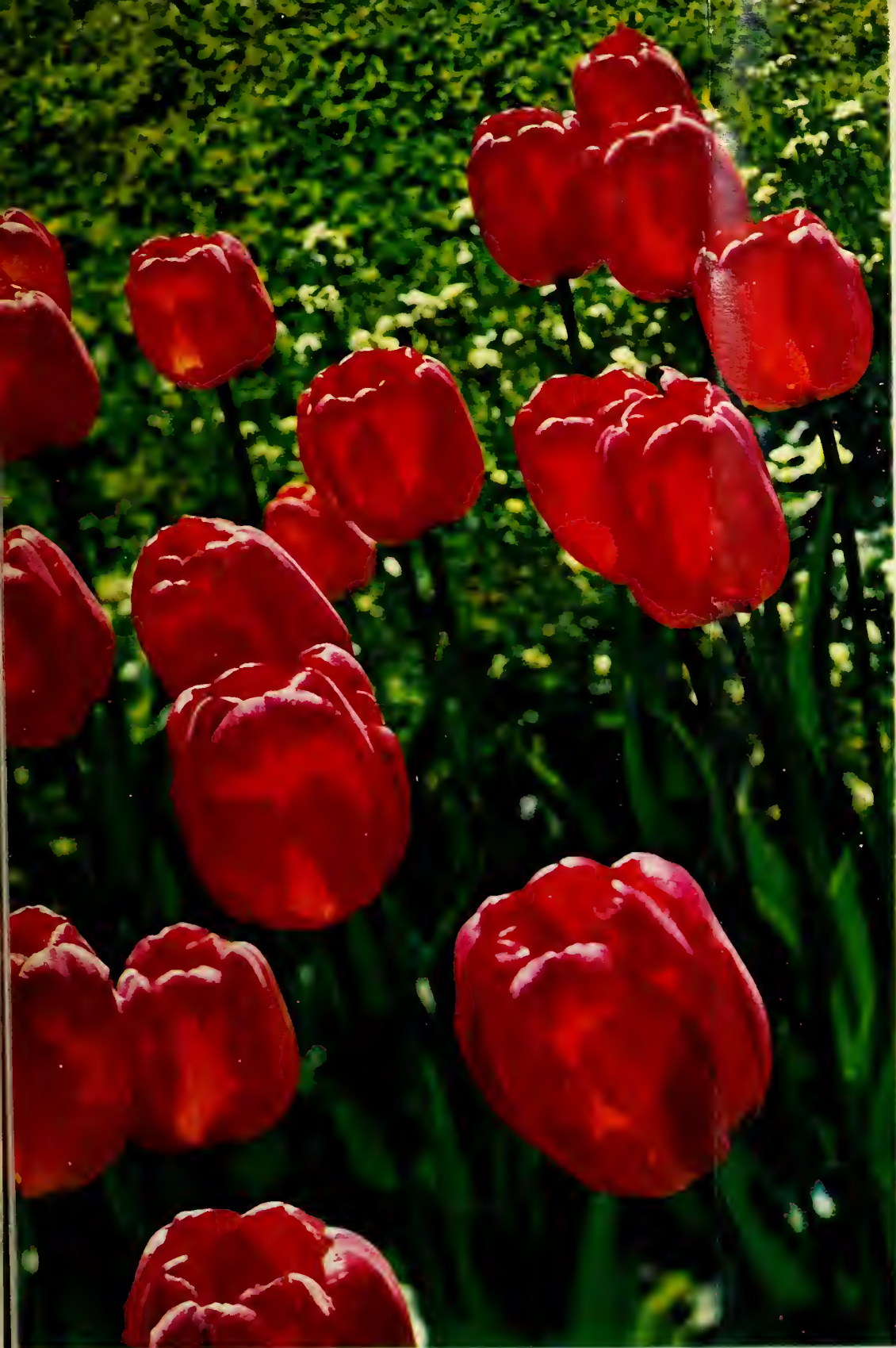
Raising their majestic heads, tall and stately in picture 31 are some tulip giants: Darwin Hybrids. This class of tulips boasts the largest flowers and tallest stems of the entire tulip world. Brilliant reds and scarlets highlight this class.