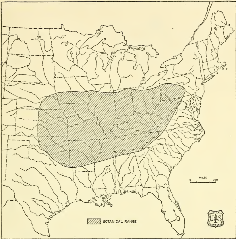
FIGURE 2.—Range of Ohio buckeye ( Aesculus glabra ).

Properties. —The heartwood of yellow buckeye is creamy white or yellowish white in color. The sapwood is also white but generally without a yellow tinge. It merges gradually into the heartwood and is not clearly defined. Occasionally the wood near the center of the log is discolored to a grayish brown. The annual rings are marked by barely visible light-colored lines. The wood is uniform in texture and is generally straight-grained. Yellow buckeye and Ohio buckeye are much alike in appearance. Both resemble the sapwood of basswood and yellowpoplar.