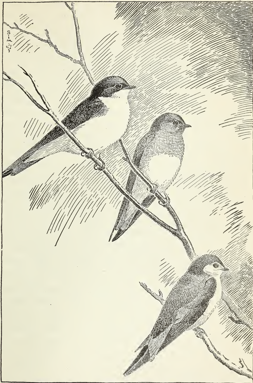
TREE SWALLOW (UPPER), ROUGH-WINGED SWALLOW (MIDDLE), AND VIOLET-GREEN SWALLOW (LOWER).