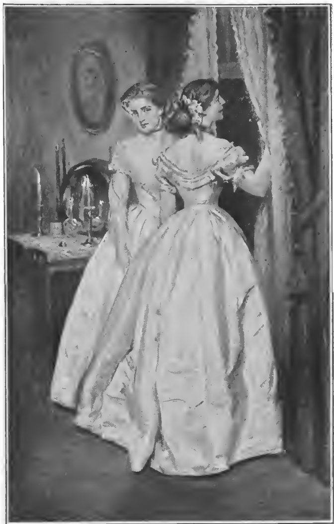
“’Tis good-by, Kincaid’s Battery”