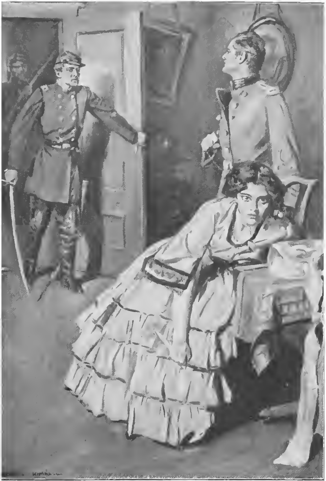
She dropped into a seat, staring like one demented