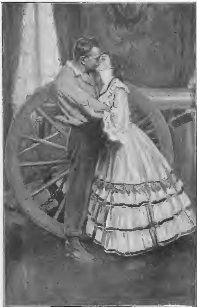
And the next instant she was in his arms