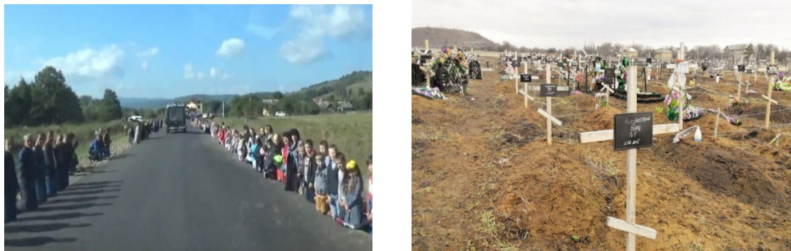
Figure 2. Different approaches to honor killed in action in Ukraine (left) 158 and Russia (right). 159

Under these circumstances, the issue of honoring a deceased warrior becomes not only a matter for his family; it becomes a powerful factor influencing the consciousness of both civilians and the military, and CIMIC Teams play a significant role in this process. They have conducted counterpropaganda and information operations in very tumultuous times and areas of the country.