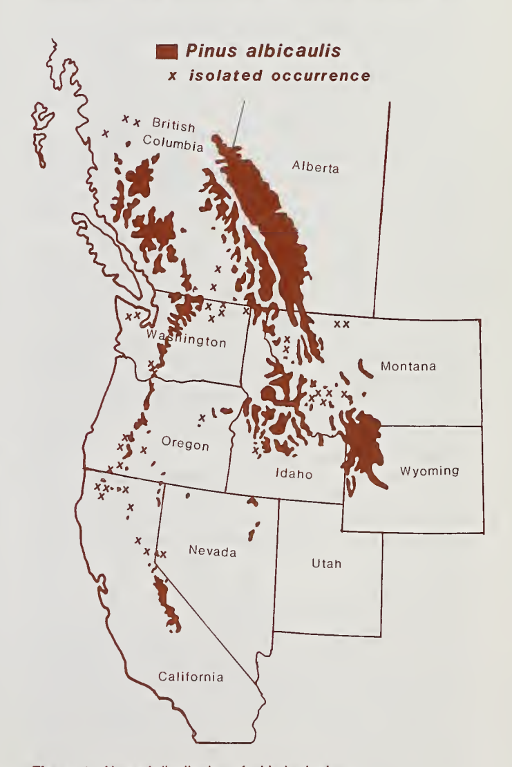
Figure 1—Natural distribution of whitebark pine.

Whitebark pine grows in a cold, windy, snowy, and generally moist climatic zone. In moist mountain ranges, whitebark pine is most abundant on warm, dry exposures. Conversely, in semiarid ranges, it becomes prevalent on