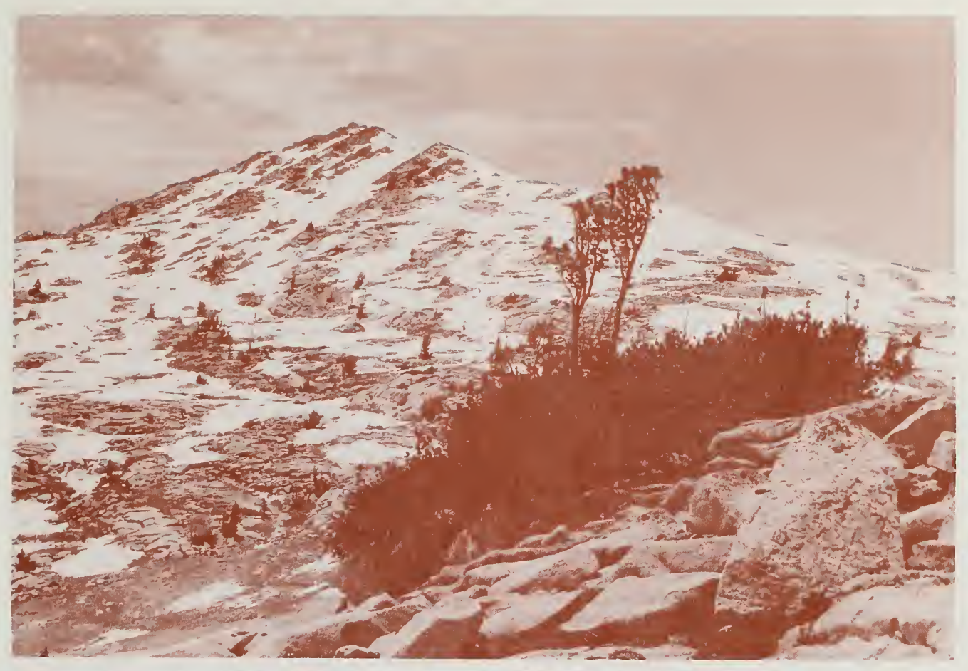
Figure 5 —Krummholz whitebark pine at 10,600-ft (3,230-m) Granite Pass, Sequoia-Kings Canyon National Park in the California Sierra Nevada. The krummholz "cushion" is protected by winter snowpack; the wind-battered upper branches are called "flags."

Whitebark pine cannot become a climax forest dominant in moist, wind-sheltered sites where its tolerant associates are capable of forming a closed stand. But it can become a long-lived seral dominant on these sites as a result of stand replacement by fire, snow avalanche, and other major disturbances.