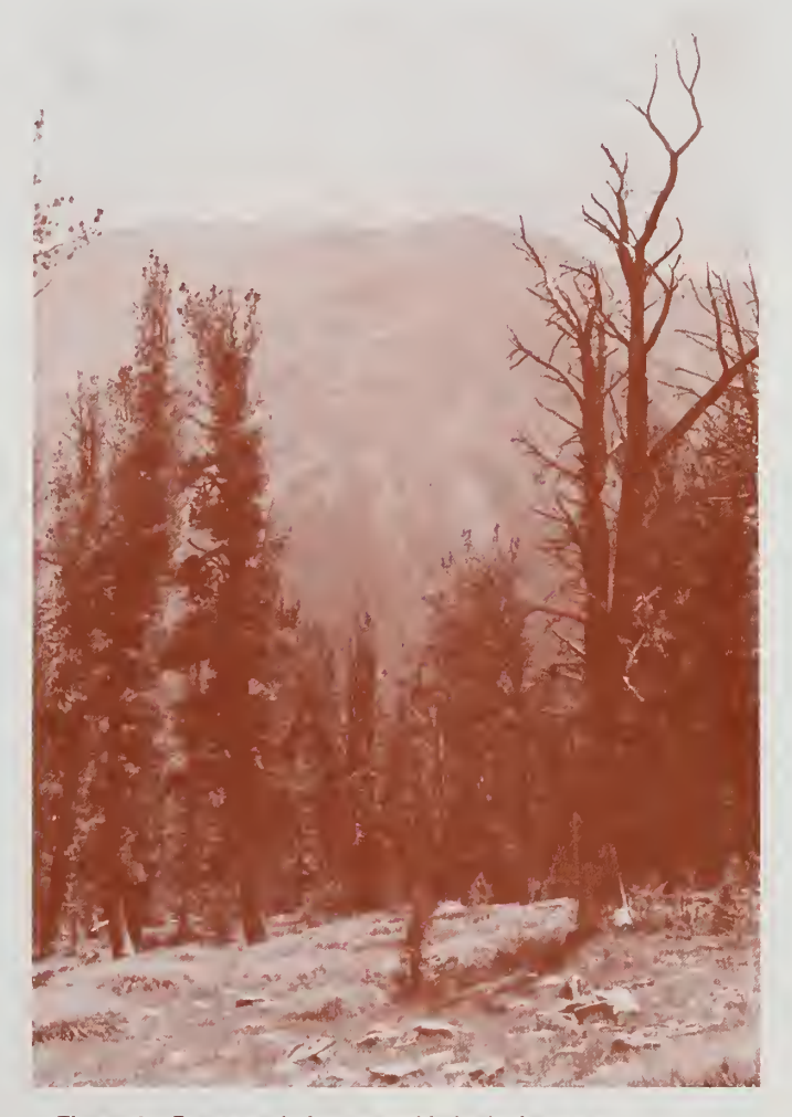
Figure 2—Pure stand of mature whitebark pine on a south-facing slope at 8,400 ft (2,560 m) elevation in western Montana.

On favorable sites near the forest line this species develops into a large, single-trunk tree commonly 35 to 65 ft (11 to 20 m) tall (fig. 2) and has a life span of 500 years or