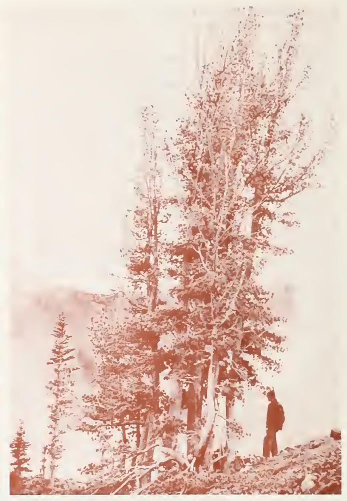
Figure 4—Multistemmed growth form of whitebark pine at tree line in the northeastern part of the Olympic Mountains, WA.

At its upper limits, whitebark pine is reduced to shrublike growth forms (fig. 5) (Clausen 1965). Such krummholz stands are often extensive on wind-exposed slopes and ridgetops. Primary causes of krummholz are thought to be inadequate growing season warmth, which prevents adequate growth, maturation, and hardening (cuticle development) of new shoots (Tranquillini 1979). As a result, shoots are easily killed by frost or by heating and desiccation on sunny days in early spring when the soil and woody stems are frozen and thus little water is available to replace transpiration losses. Mechanical damage