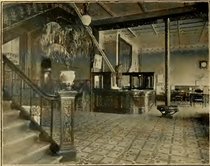
Tower Hotel Office