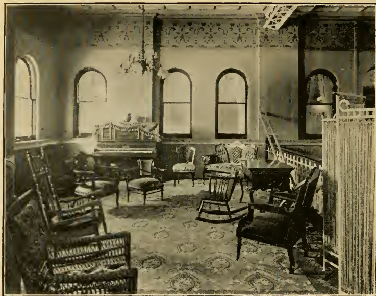
Tower Hotel Parlor