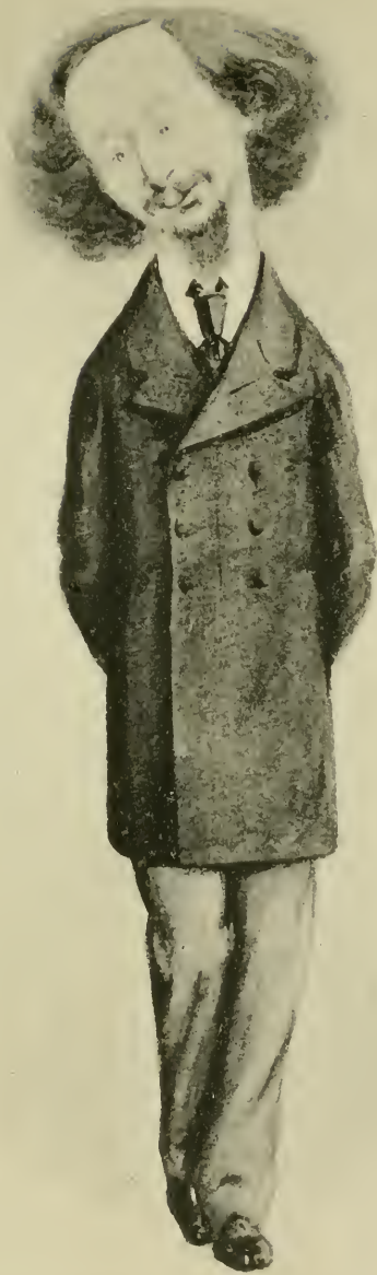
From a drawing from life, in 1874, by Carlo Pellegrini