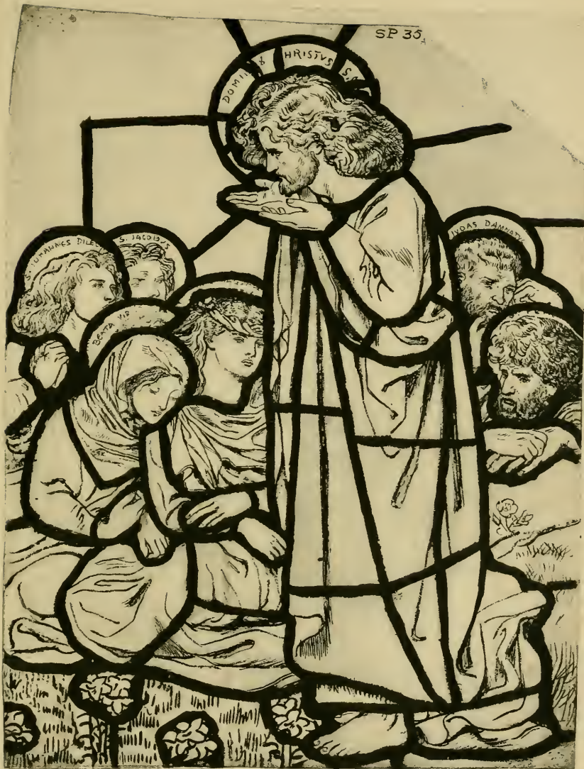
Cartoon for Glass, designed by D.G. Rossetti containing portraits of A.C. Swinburne and Christina Rossetti