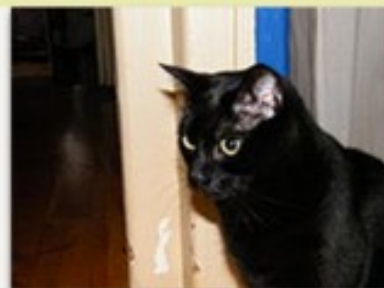
Ebe123, Teahouse host