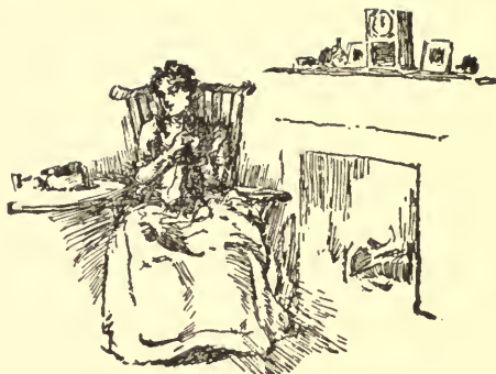
“Harriet near the fireplace rocking and sewing”