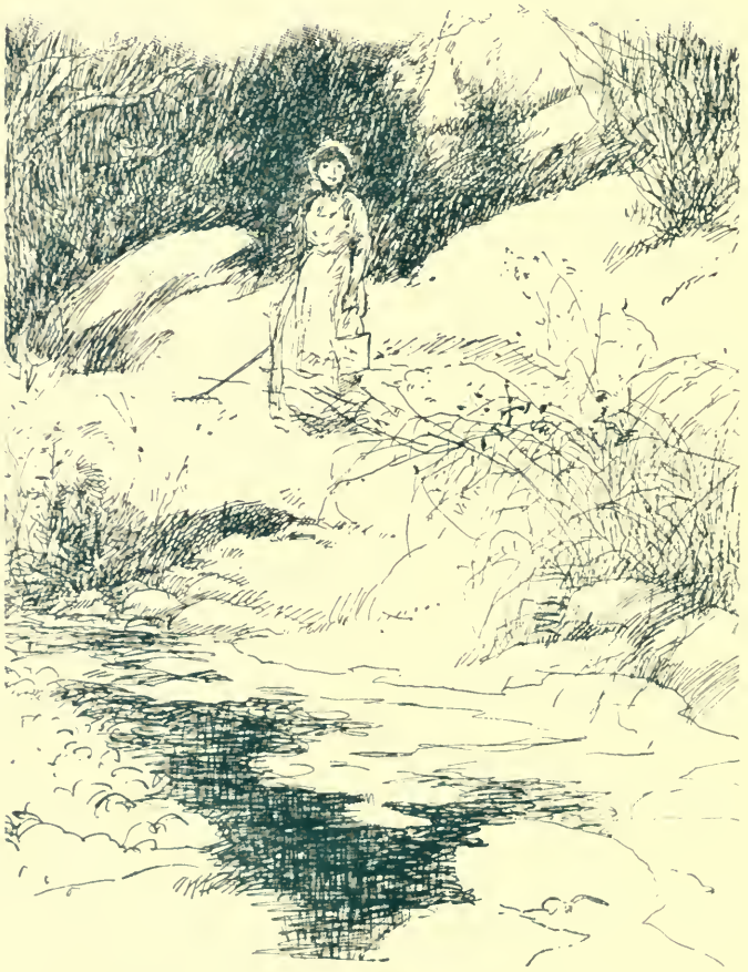
“ THE PLACE OF THE RUSHES AND THE FLAGS ”