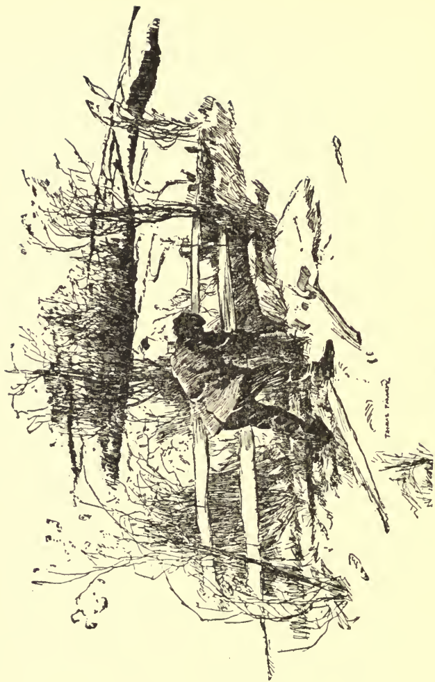
“WORKED WITH MY AXE AND HAMMER.”