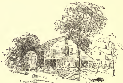
The barn yard