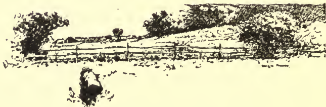
“He knelt to examine some object”