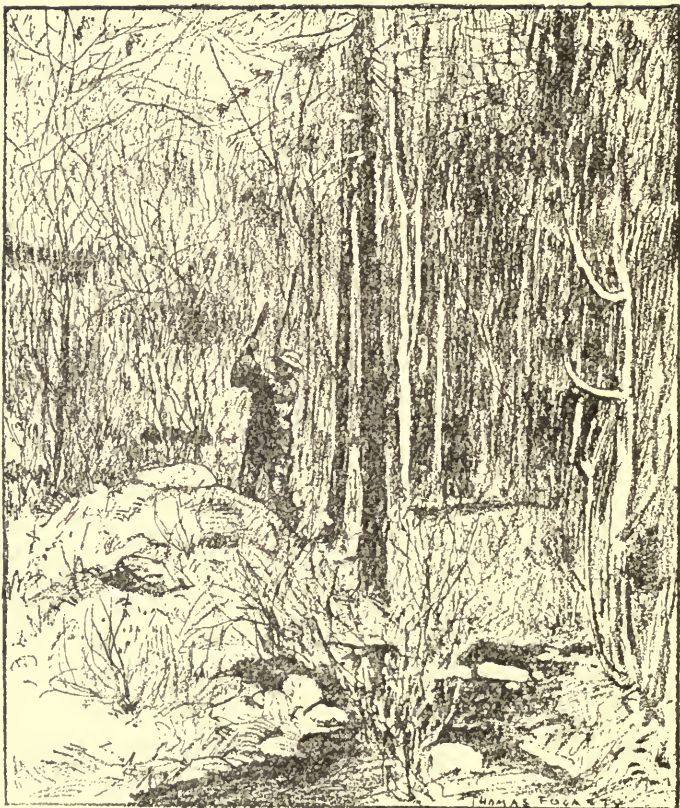
“LET MY AXE FALL”