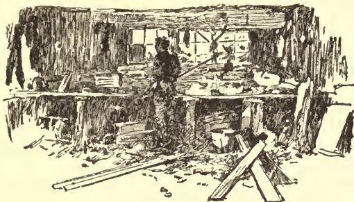
The carpentry shop