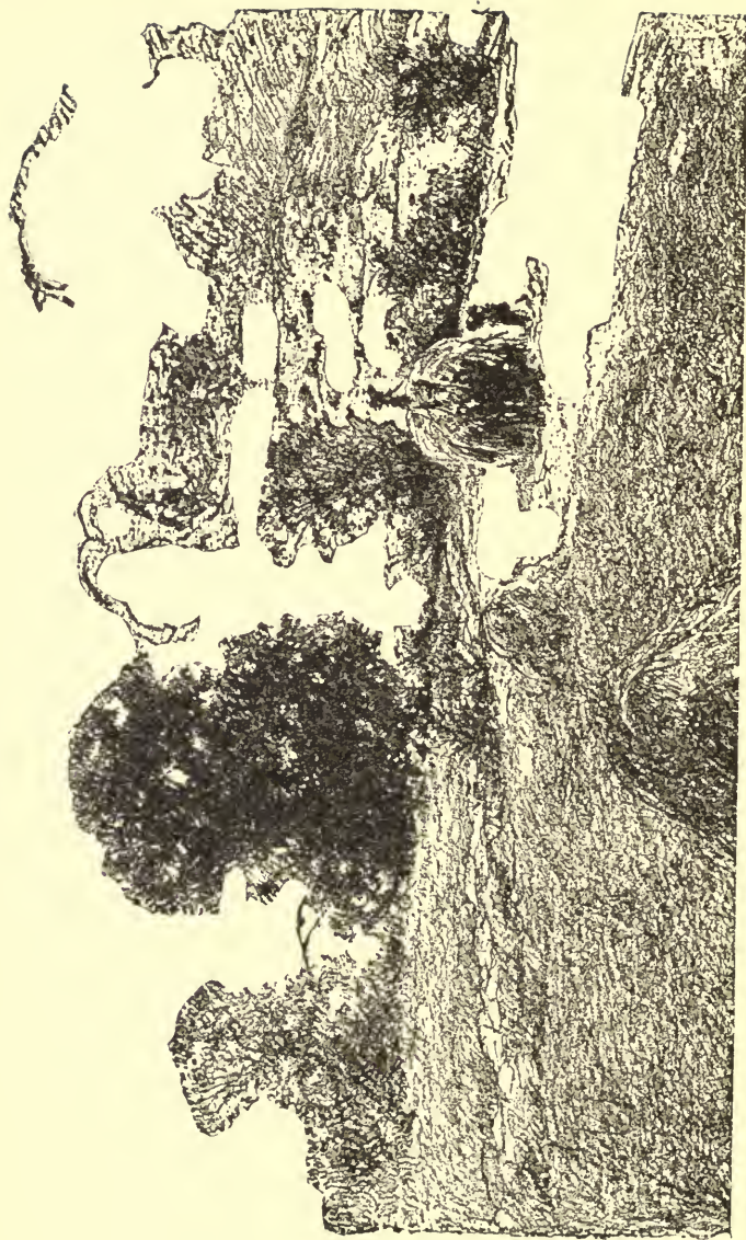
“HOW GRACEFUL CLIMB THESE SHADOWS ON MY HILL.”