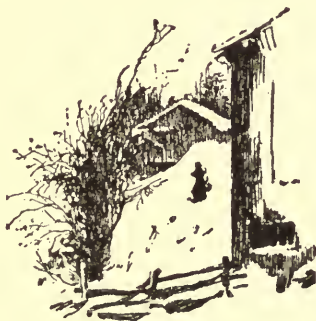
The cow stable

So I went back to my work, thinking how many fine people there are in this world — if you scratch ’em deep enough.