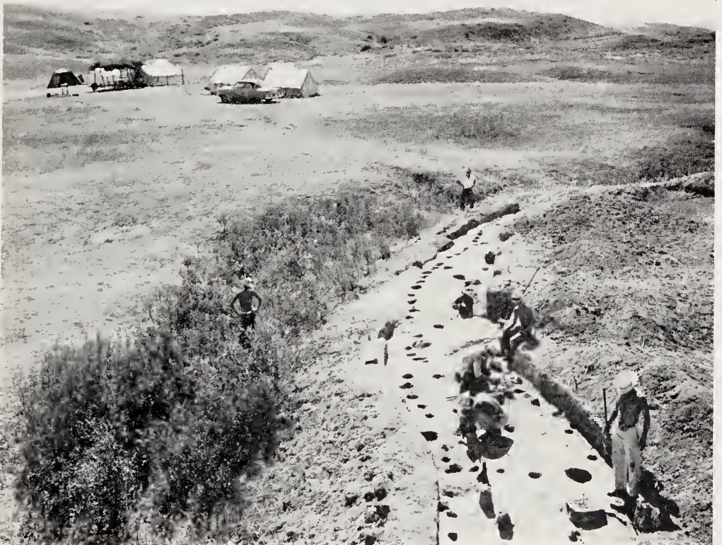
2. River Basin Surveys: Long curved line of post holes shows location of palisade at the Cheyenne Village. Men working on small cache pits and other post holes inside the stockade. Field camp in background.