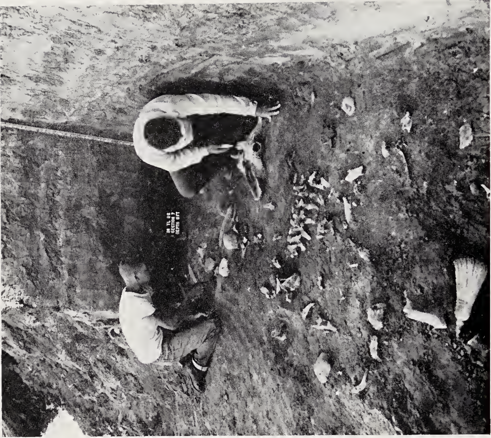
2. River Basin Surveys: Uncovering remains of a bison kill at a camp site in the Tiber Reservoir area. Occupation level was 8 feet below the present surface.