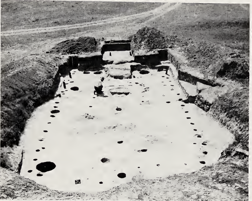
1. River Basin Surveys: Floor pattern of rectangular earth lodge at the Cheyenne Village site. Rows of holes indicate position of walls. Larger holes were cache pits. Entrance platform at far end. Workman is kneeling by fire pit