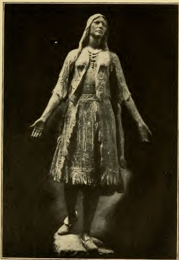
POCAHONTAS, THE FRIEND OF THE ENGLISH.