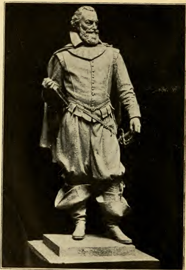
CAPTAIN JOHN SMITH.