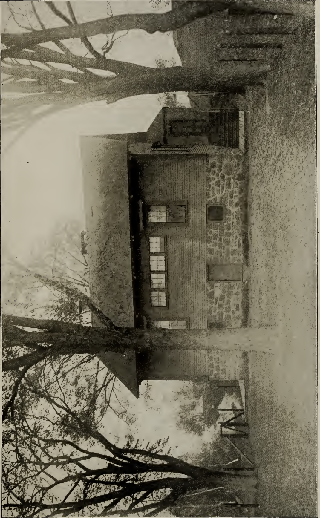
MODEL RURAL SCHOOL.