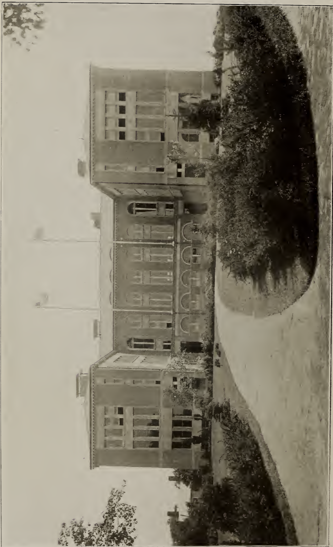
STATE NORMAL SCHOOL, SALEM.