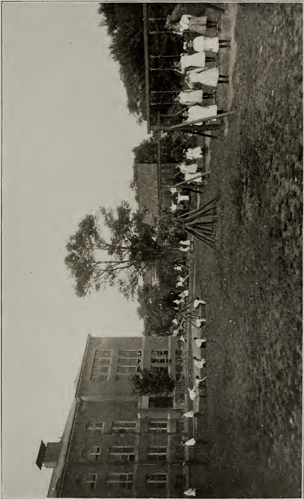
PLAYGROUND EQUIPMENT MADE BY BOYS OF SEVENTH AND EIGHTH GRADES.