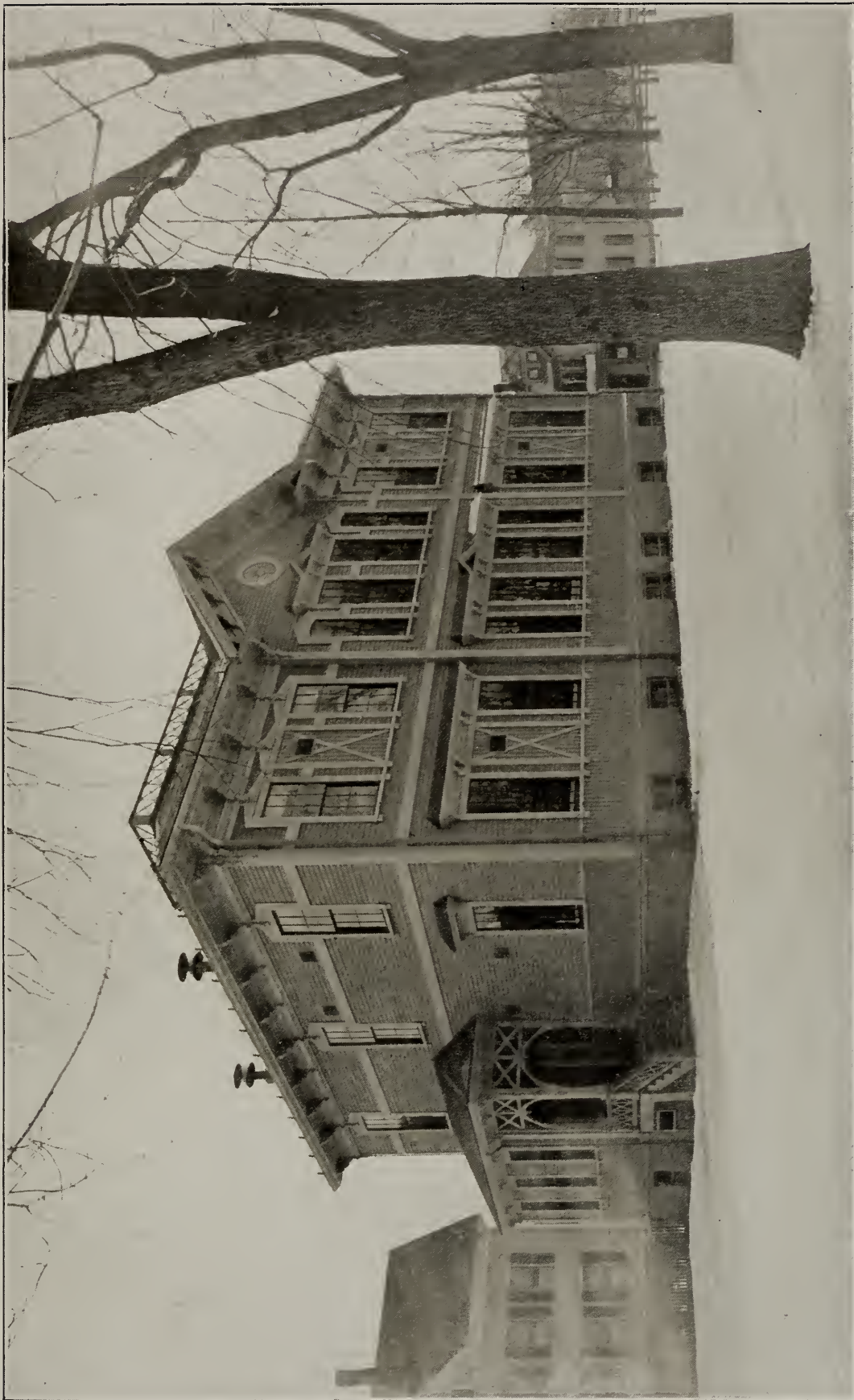
BERTRAM PRACTICE SCHOOL.