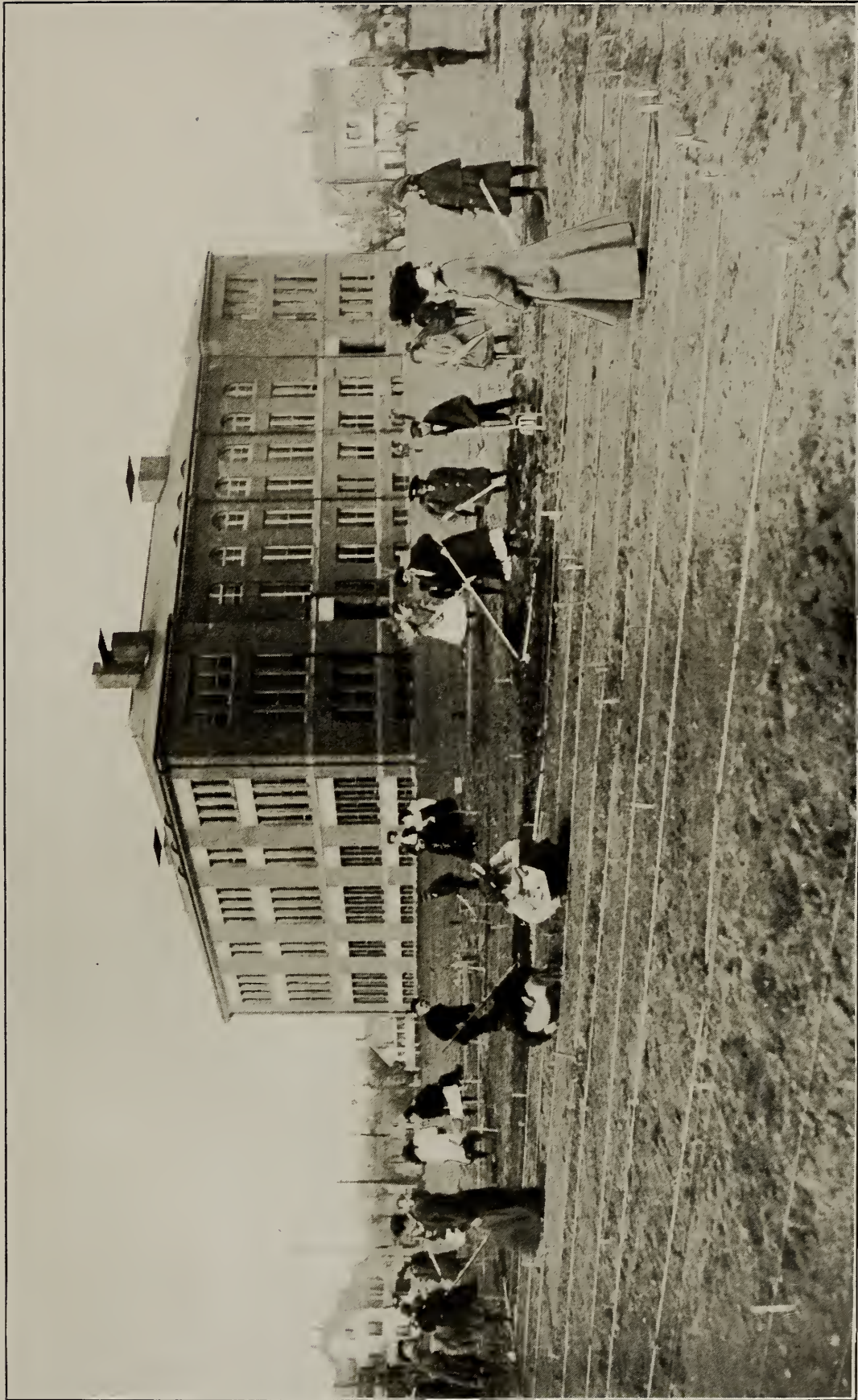
LAYING OUT THE GARDEN.