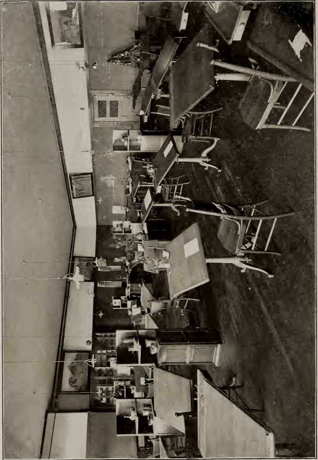
DRAWING AND THE FINE ARTS.