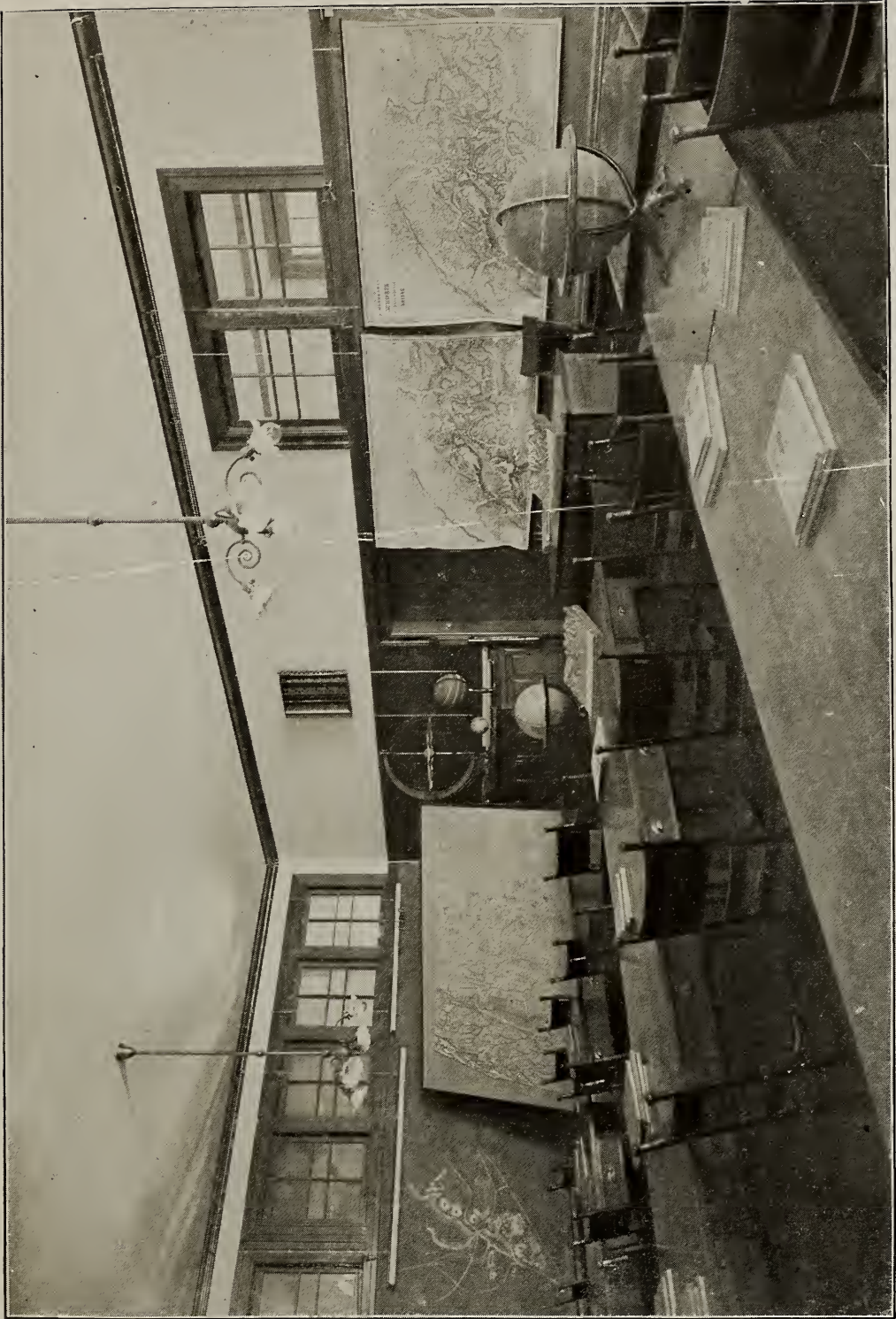
THE GEOGRAPHY ROOM.