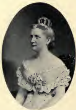
Mrs. Henry E. Johnston (Harriet Lane) Page 219