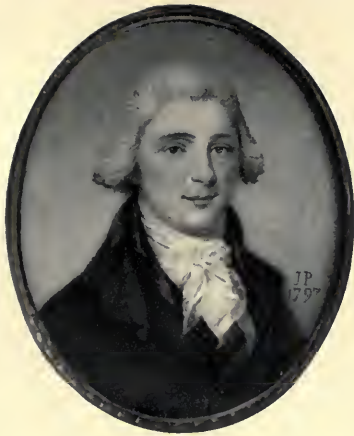
Christopher Greenup By James Peale Page 127