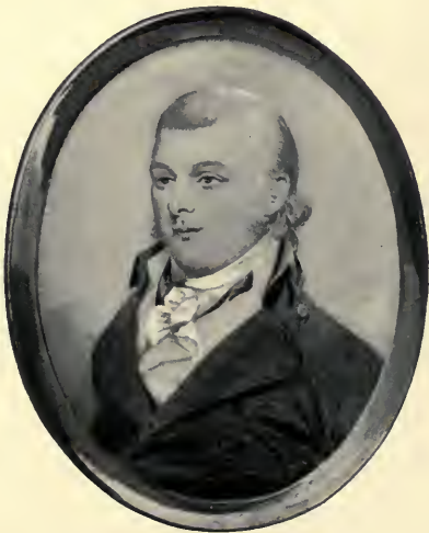
Tench Francis By James Peale Page 127