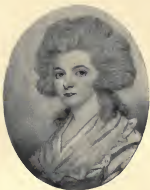
Russian Princesses By Edward Miles Page 210