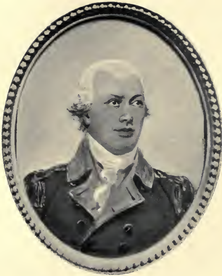
Major-General Nathanael Greene By John Trumbull Page 113