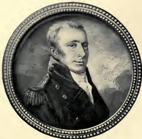
Colonel Tobias Lear Page 131