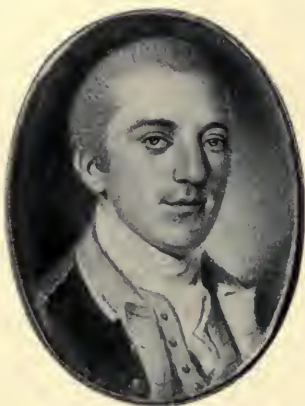
Colonel John Laurens