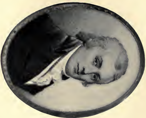
Joseph Kirkbride Milnor