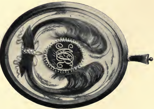
Reverse of Miniature