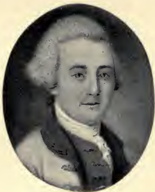
General John Cadwalader Page 32