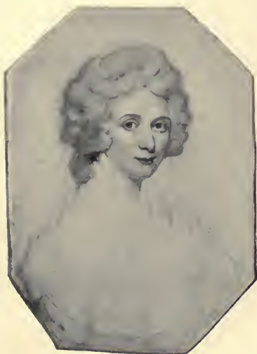
Unfinished miniature By Edward Miles