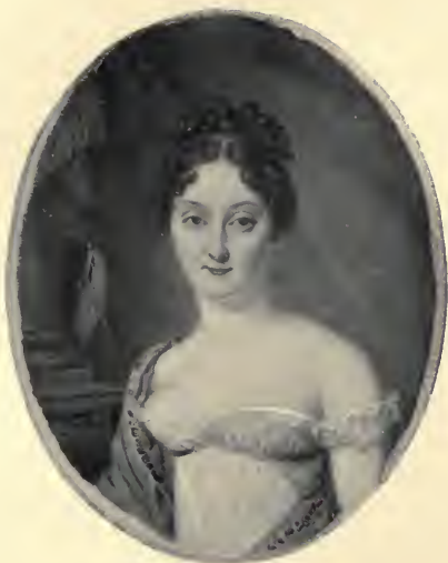
Madame Jerome Bonaparte By Jean Baptiste Augustin Page 235