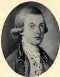
The Right Reverend William White By Charles Willson Peale Page 48