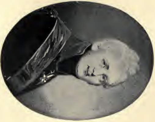
Alexander I. of Russia