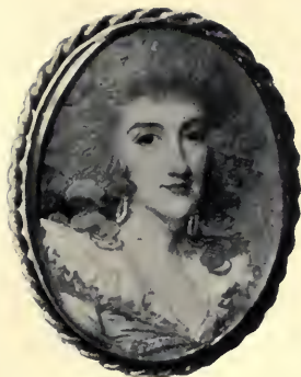
Niece of Admiral Coffin By Richard Cosway