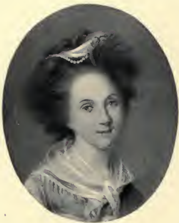
Mrs. Charles Willson Peale (Rachel Brewer) By Charles Willson Peale Page 83