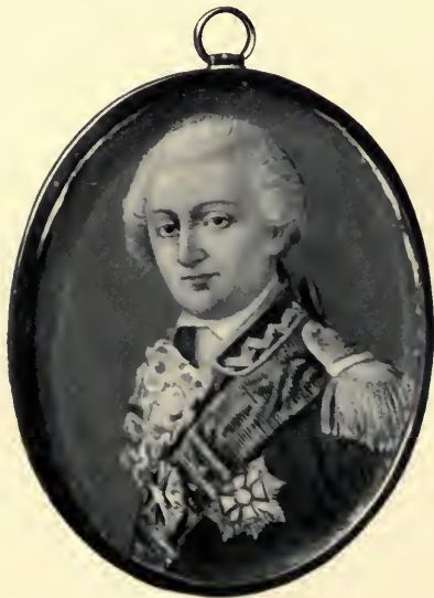
Admiral, Lord Rodney By John Singleton Copley Page 56