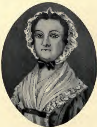
Mrs. Jacob Leisler Page 28