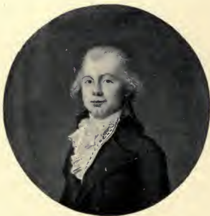
James Monroe By Sené Page 129