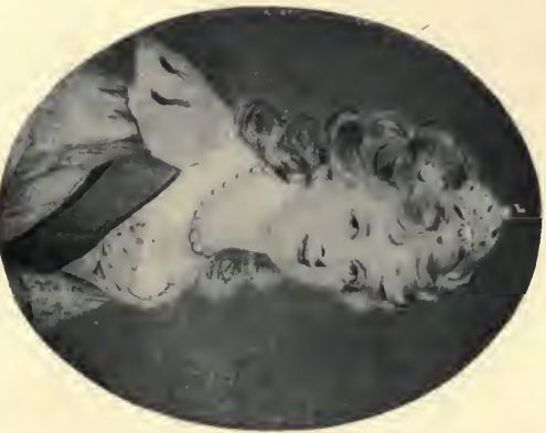
Empress Maria Louisa