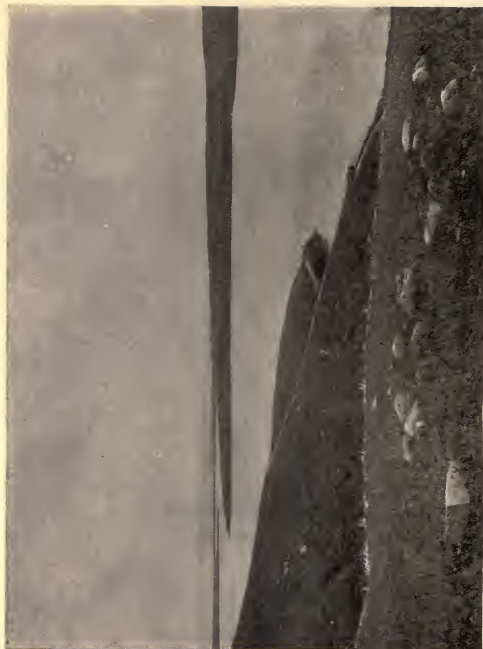
INDIAN GRAVES ON FORT HILL, MONTAUK