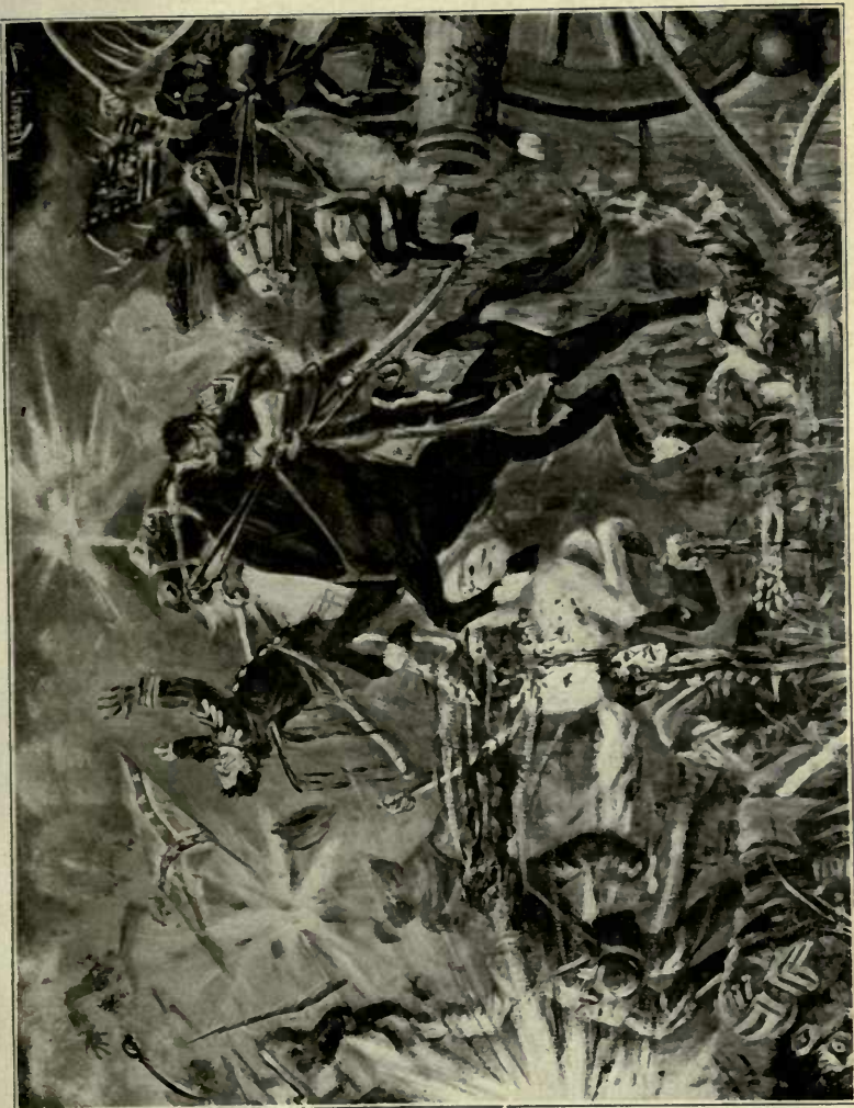
“He found the histories—so-called—simply the printed accounts of bloody deeds of war heroes!”