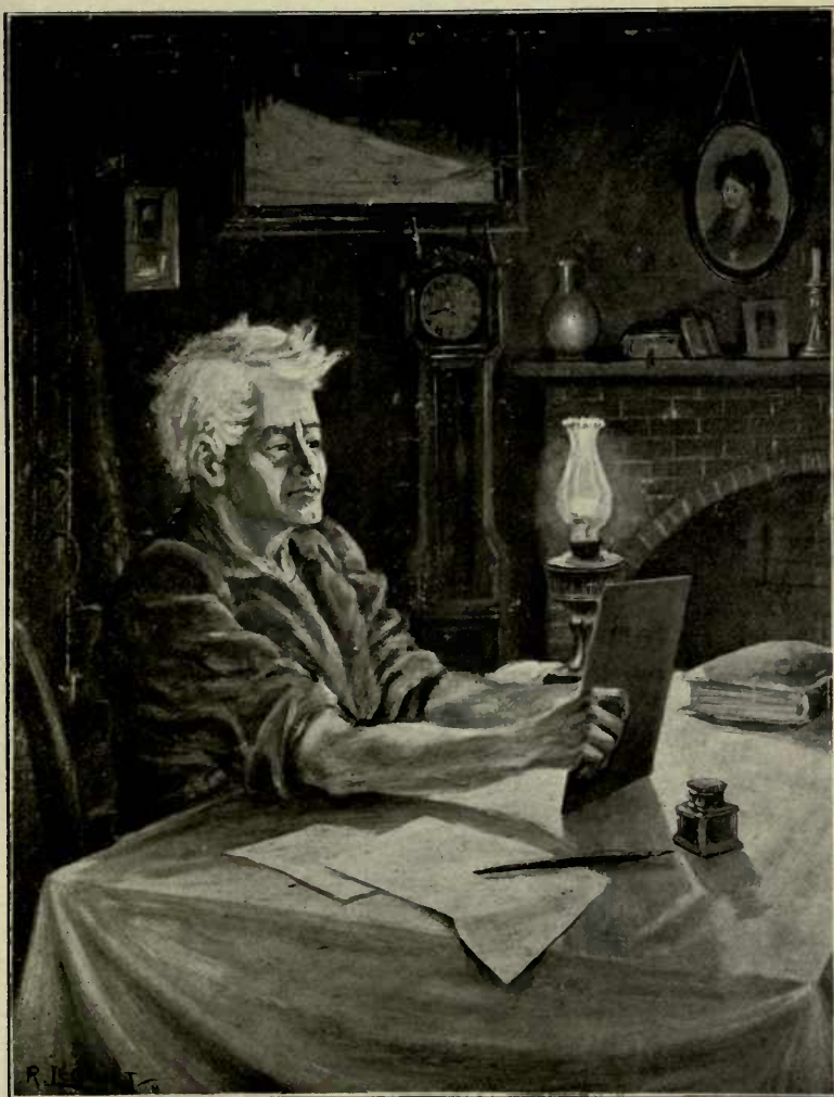
"He gazed reverently upon the two faces."