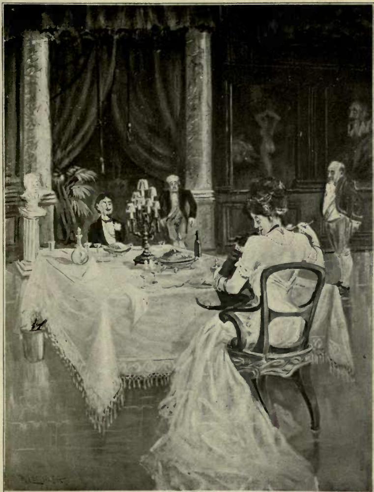
"The bawd-attired mistress of a screw-tailed terrier fed that $10,000 beast sponge cake and cream from her own plate."