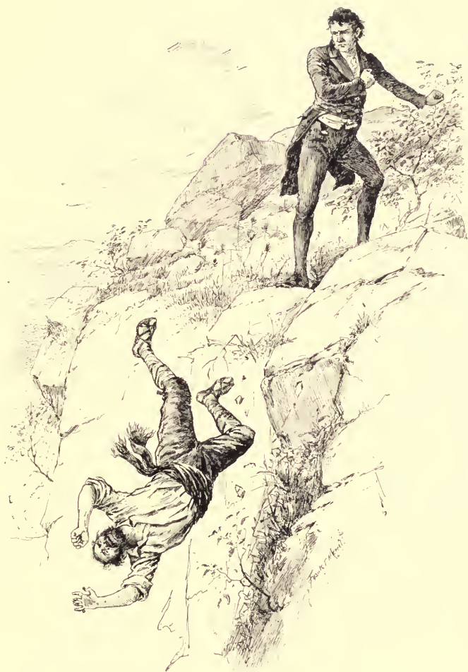
Drawn by Frank T. Merrill.