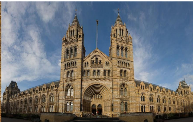
Wikimedian in Residence Natural History Museum and Science Museum, London