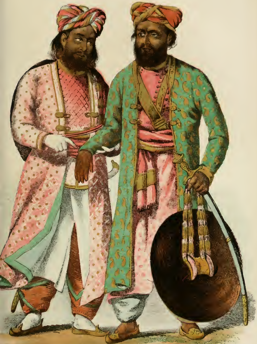
UJDAR KHAN BUHADDOOR (Ahzye)