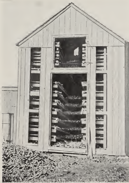
Curing room for Sweet Corn and system of ventilation during late summer.

The side picture represents one of my sweet corn curing houses thoroughly ventilated. The above cut shows my large seed corn warehouse where all of my flint and dent corn is dried and made ready for shipment. Everything is thoroughly up to date in regard to cleaning, sorting, shelling, etc. The ventilators can be closed in stormy weather and seed corn is thoroughly protected from all unfavorable weather conditions.