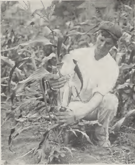
An ear of Malakhof Sweet Corn in edible condition.

This variety of sweet corn we have developed from a small quantity of seed which was secured from the seed introduction division of the Bureau of Plant Industry of the U. S. Dept. of Agriculture.