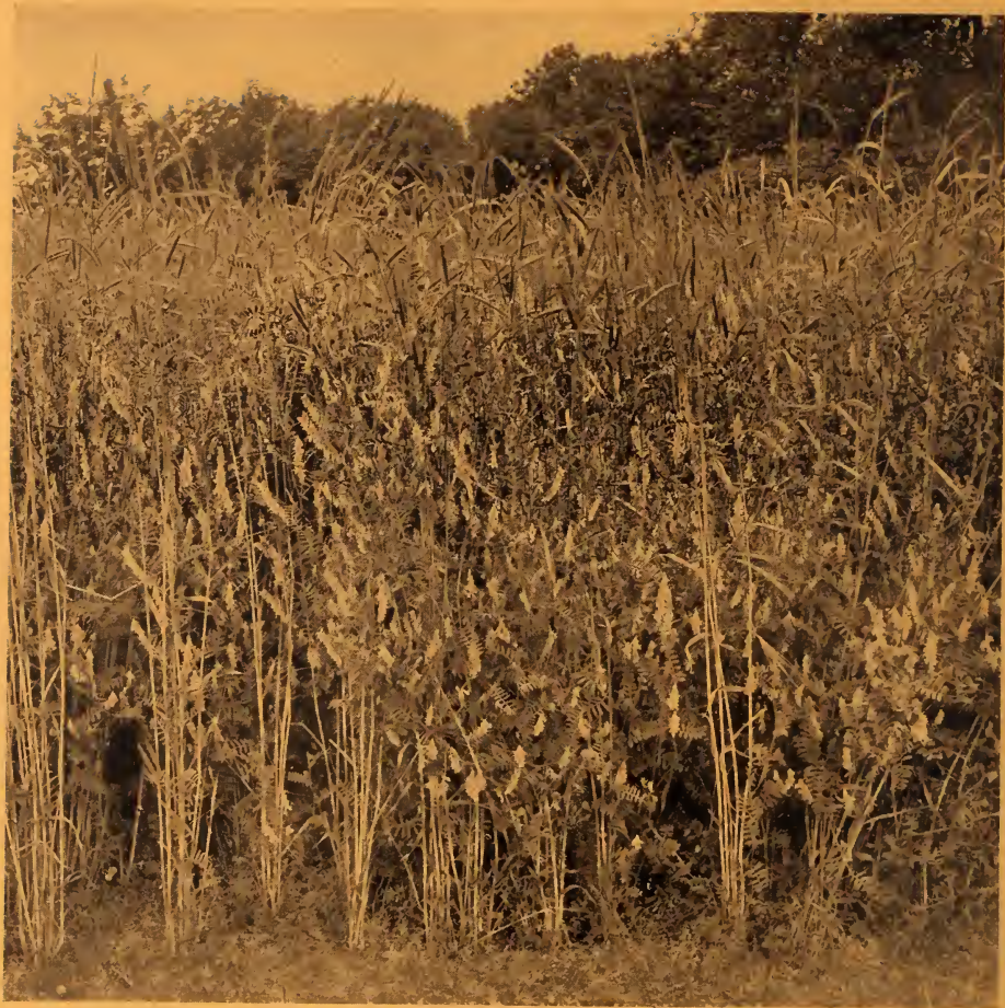
Our field of Acclimated Hairy Vetch grown for seed with rye. After harvest the rye seed was all separated from the vetch seed with a special vetch seed separator.