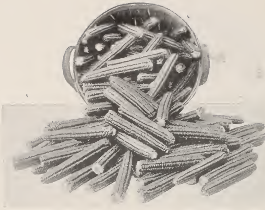
A bushel of my Yellow Flint Seed Corn.

This variety has been grown by my grandfather, father and myself on our farm for over sixty years. It is one of the earliest types grown in New England. We have improved the varieties by careful seed selection, and have developed a very uniform and productive variety of Flint corn. I can recommend it wherever Flint Seed Corn is desired. The plants are large, leafy, tender, and the ears are of a beautiful golden color. The plants will average 8½ feet in height, and the ears are about 11 inches in length, 6¼ inches in circumference. The ears bear eight rows of kernels, and about 50 kernels in the row.