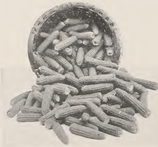
A bushel of seed ears of my strain of Early Crosby Sweet Corn.

I consider this the best variety of sweet corn for home planting or canning purposes in existence. We have been scientifically breeding this variety for six years testing our breeding stock for sugar content by chemical analyses and other tests, and propagating the higher yielding ears, with highest sugar content. It is very uniform early, and produces an extremely eatable and delicious table corn. By planting a few hills, a week apart, from May 15th to June 15th, a succession of tender, sweet and nourishing table corn can be had all summer. I would like to see every lover of high grade table corn, plant a quart of this seed or more.