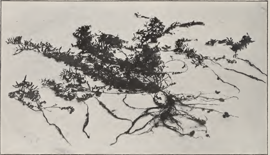
Several specimen plants of Hairy Vetch showing Nodules.

A limited amount of this acclimated seed will be ready for delivery about Aug. 1, 1911. Price $5.00 per bushel, or 10c. per pound. 40 to 60 pounds per acre of this seed should be sowed for cover crop purposes.