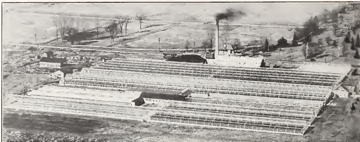
E. G. HILL CO'S PLACE