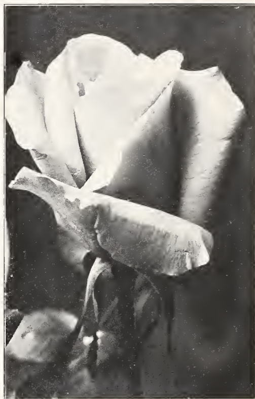
Double White Killarney

The color is a magnificent shade of red. The bud long-pointed and the open flower beautiful, with extreme size and good color to