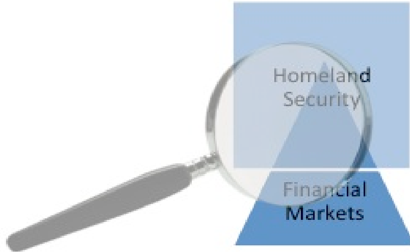
Figure 4. Literal analysis: Examining the overlay of homeland security and financial markets. Learning is by ‘seeing’ attributes, relationships, and similarities common to both domains.

The literature review discusses the advantages and limitations of using metaphor and analogies to integrate new information and ideas with prior knowledge. The literature review also examines research on risk and uncertainty to better understand their multiple dimensions, definitions, and nuances.