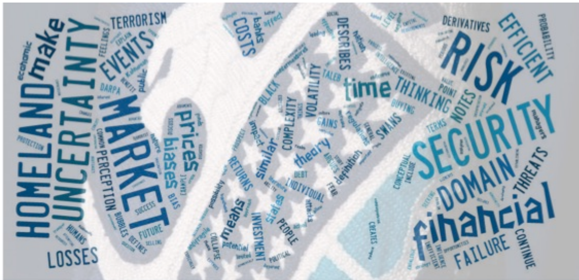
Figure 2. Thesis word cloud: Visually interpreting the major themes of this thesis and how they fit into the picture of homeland security. 18

quantitative and qualitative waters of risk every time they “open their wallets” to buy or sell securities. Market participants, whether investors or homeland security practitioners, react to risk that is inherent in markets. Neo-classic economic thought and diverse fields such as behavioral economics, psychology, prospect theory, and complex systems, illustrate why markets behave as they do and how humans understand and react to risk and uncertainty (see Figure 2). 17