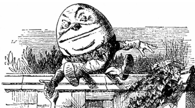
Figure 1. Alice meets Humpty Dumpty. Illustration by Tenniel from Carroll's Through the Looking Glass .

“Not so,” said Humpty-Dumpty, “the question is which is to be the master. That’s all.” 13