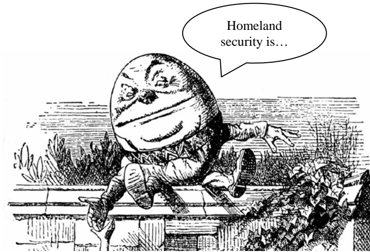
Figure 6. Humpty Dumpty in the midst of a discussion with Alice on the meaning of homeland security (adapted from illustration by John Tenniel from Carroll's Through the Looking Glass .)

As Humpty Dumpty alludes, homeland security can mean different things to different people. However, varying definitions of homeland security can cause misalignment with budgets and homeland security strategies. 179 While the definition of homeland security continues to evolve, this thesis sets out to understand homeland security through the lens of risk and uncertainty. It looks across domains to financial markets to explore how humans interact and make decisions when surrounded by risk that is dynamic.