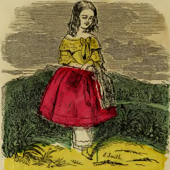
LITTLE EVA, THE FLOWER OF THE SOUTH.

LITTLE Eva lived in the bright sunny South, in the State of Alabama. She was the only daughter of a wealthy planter, who owned many slaves, and a large plantation. Eva was the joy and pride of her parents, she obeyed them in everything; she had a smile or a kind word for all; she is called the Flower of the South.