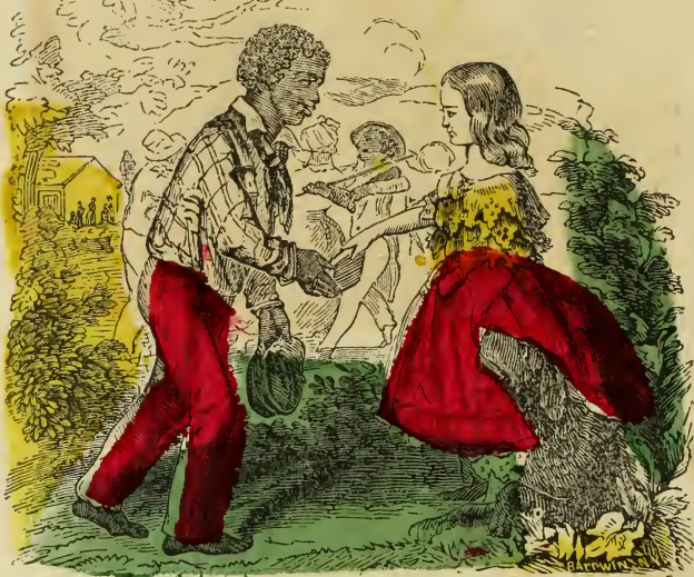
LITTLE EVA'S BIRTH-DAY.

This is Eva's birth-day. She is just nine years old; there is double rejoicing, both because Eva was saved from drowning, and because it is her birth-day. See, she is presenting Sam with a beautiful Bible, as a token of her esteem. Eva's parents were so pleased with Sam for saving Eva, that they gave him his freedom; but he never left them, he loved them all too well.