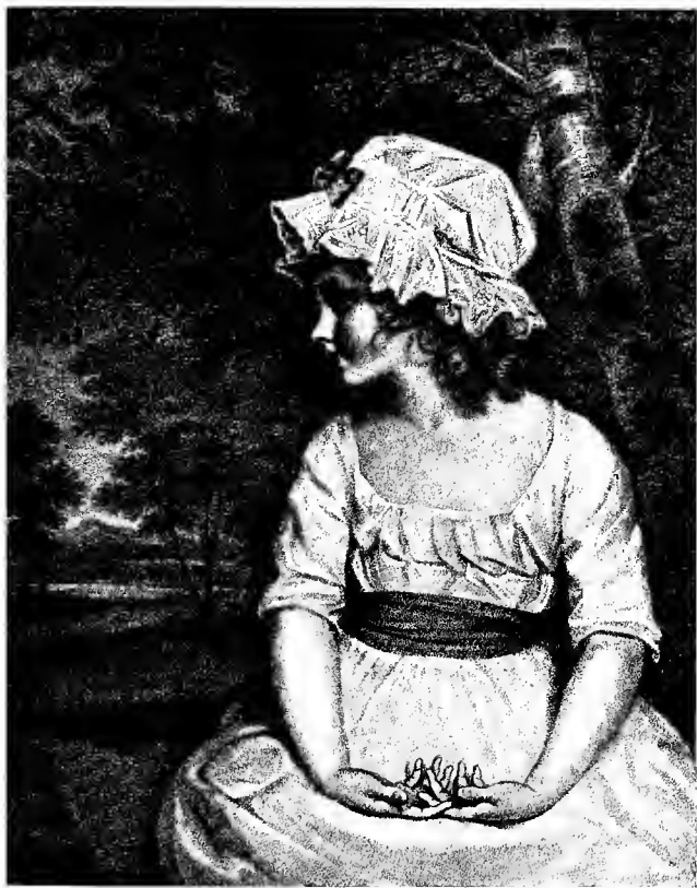
Simplicity (p. 177).