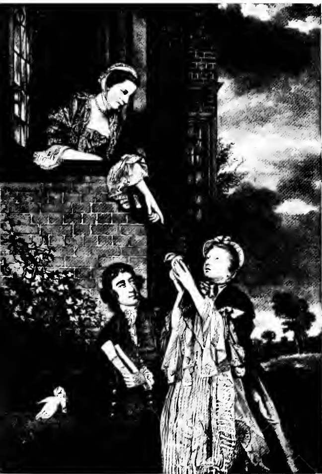
Young Fox with Ladies (p. 59).