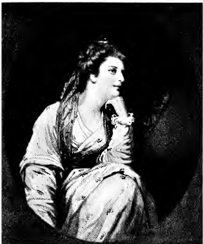
Lady Waldegrave (p. 53).