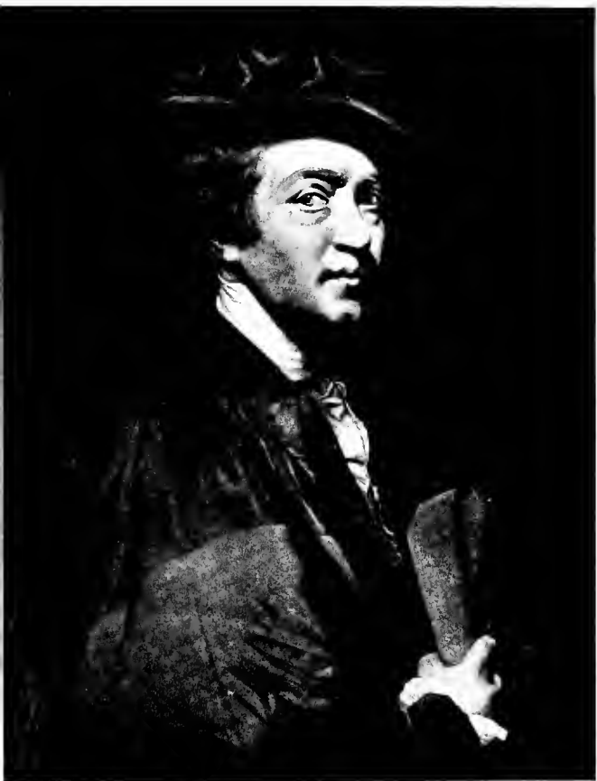
Sir J. Reynolds (p. 14).