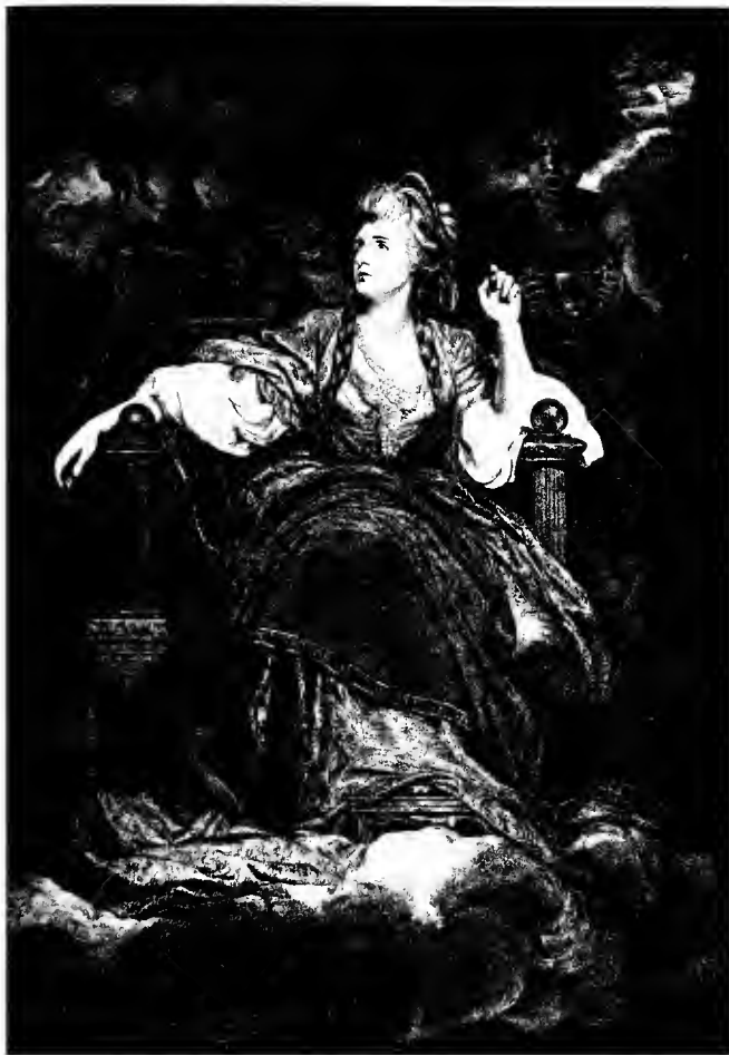
Mrs. Siddons as the Tragic Muse (p. 155).