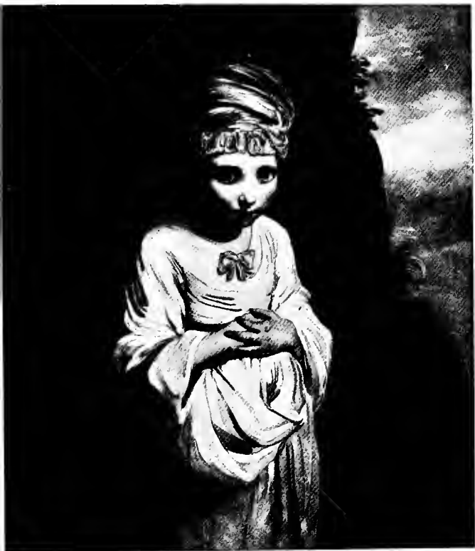
Strawberry Girl (p. 119).