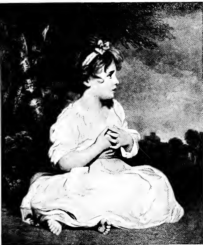
Age of Innocence (p. 176).