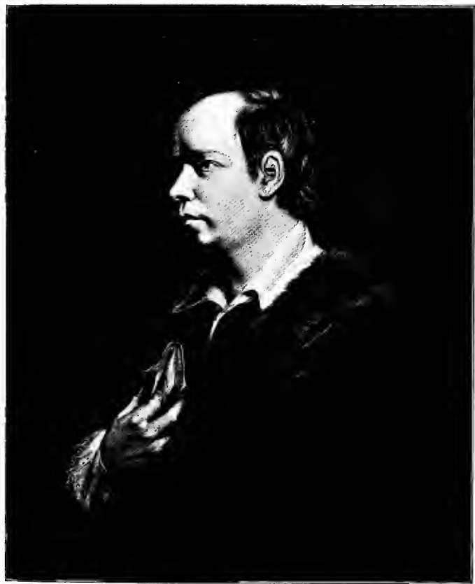
Goldsmith (p. 72).