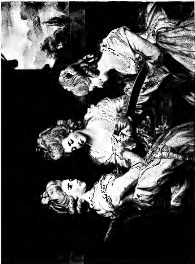
The Waldegrave Sisters (p. 147).