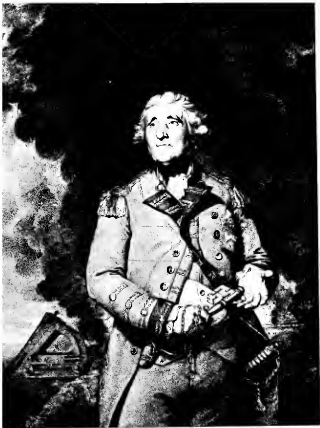
Lord Heathfield (p. 173).