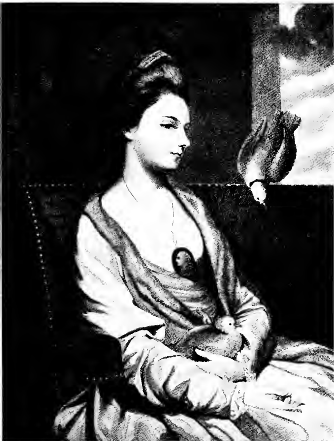
Kitty Fisher (p. 52).