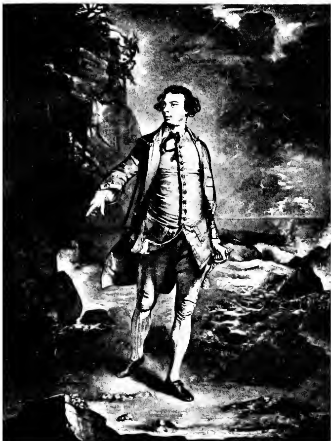
Admiral Keppel (p. 28).