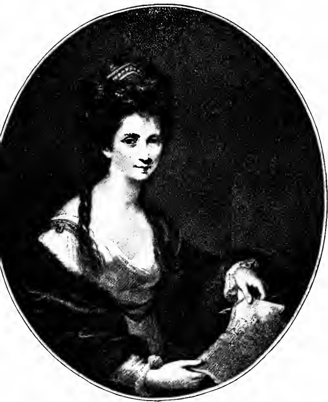
Angelica Kauffmann (p. 73).