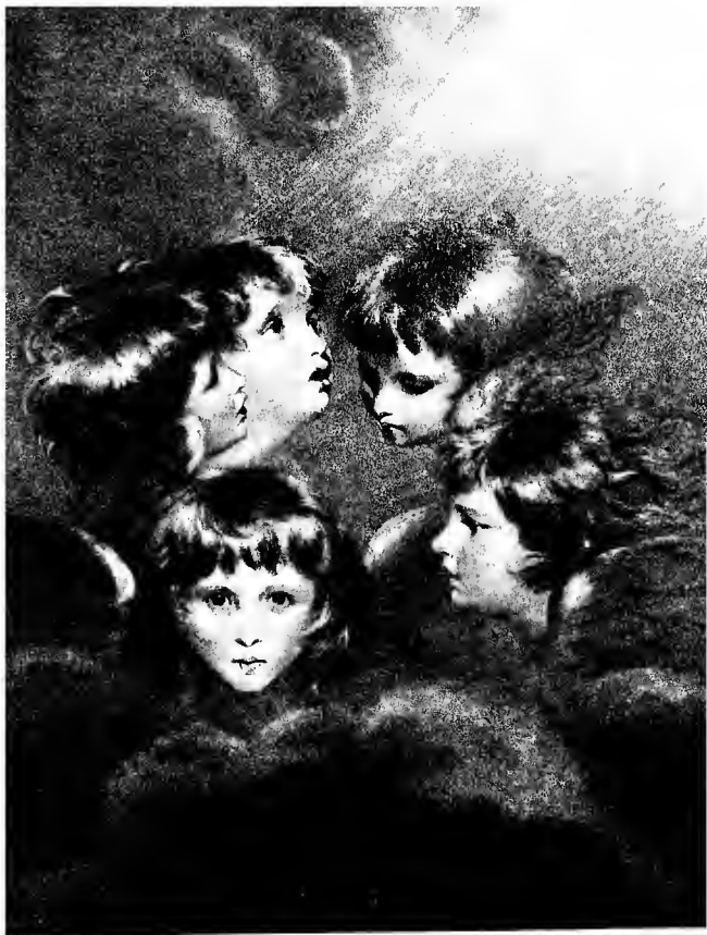
Angels' Heads (p. 170).