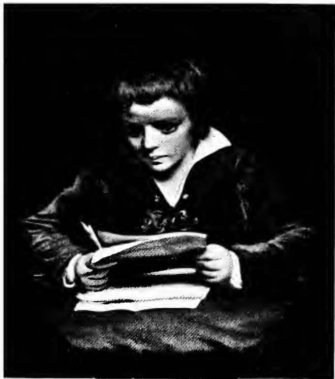
Boy Reading (p. 13).