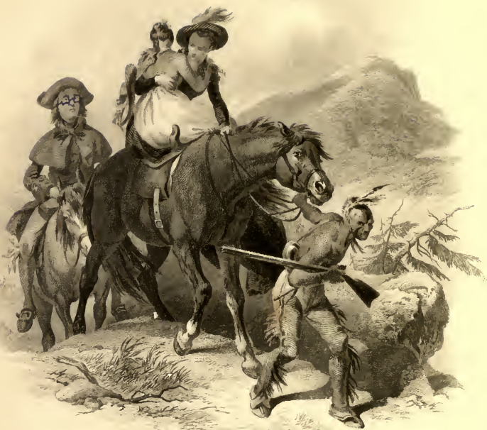
CHAPTER XLV.—The last of the Mohicans with Cora and her child. The last of the Mohicans with Cora and her child. Last of the Mohicans