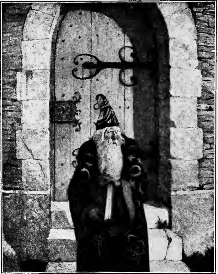
ON THE FOURTH DAY COMES THE ASTROLOGER FROM HIS CRUMBLING OLD TOWER