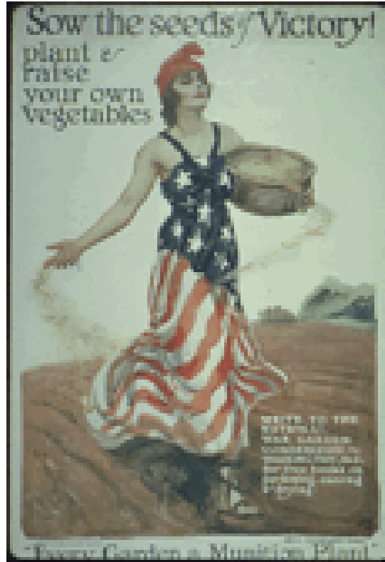
Figure 4. Sow the Seeds of Victory 225

indirectly aiding the war effort, these gardens were also considered a civil morale booster, in that gardeners felt empowered by their contributions of labor and rewarded by the produce grown (see Figure 4). All of these benefits made victory gardens a part of daily life on the American home front.