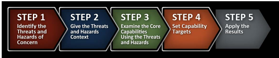
Figure 1. The Five-Step THIRA Process

The THIRA process consists of five basic steps outlined in Figure 1 and explained below.