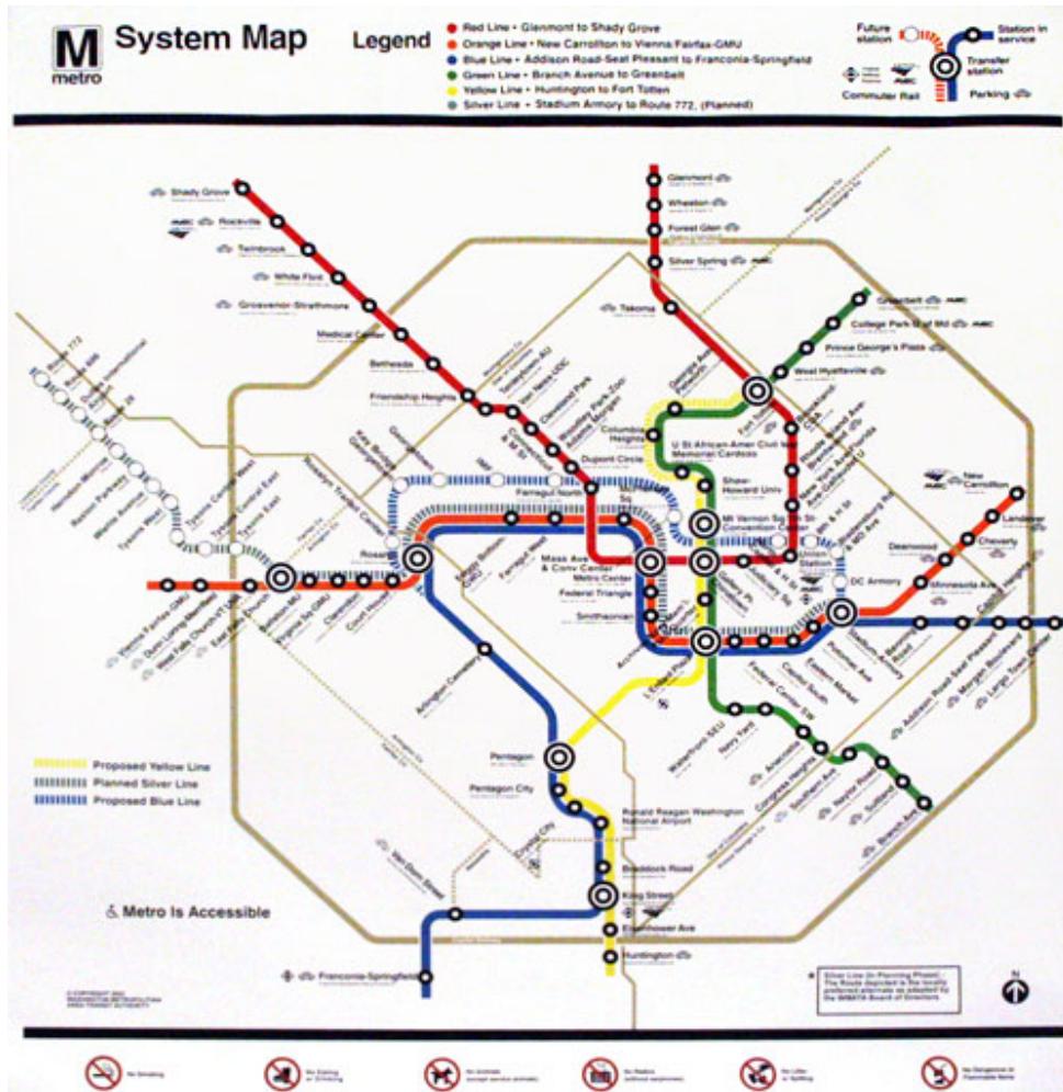
Figure 2. WMATA Rail Map 176

connected. 174 Infrastructure such as electrical power, telecommunications, transportation, and water (what some consider the life sectors) can be modeled as networks as depicted in Figure 2. Then these networks can be analyzed rigorously to identify assets that may be at risk. 175 Lewis’s five-step process is discussed in more detail below.