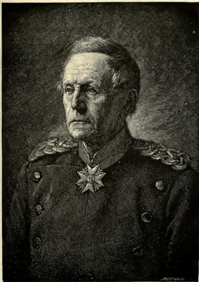
GENERAL VON MOLTKE