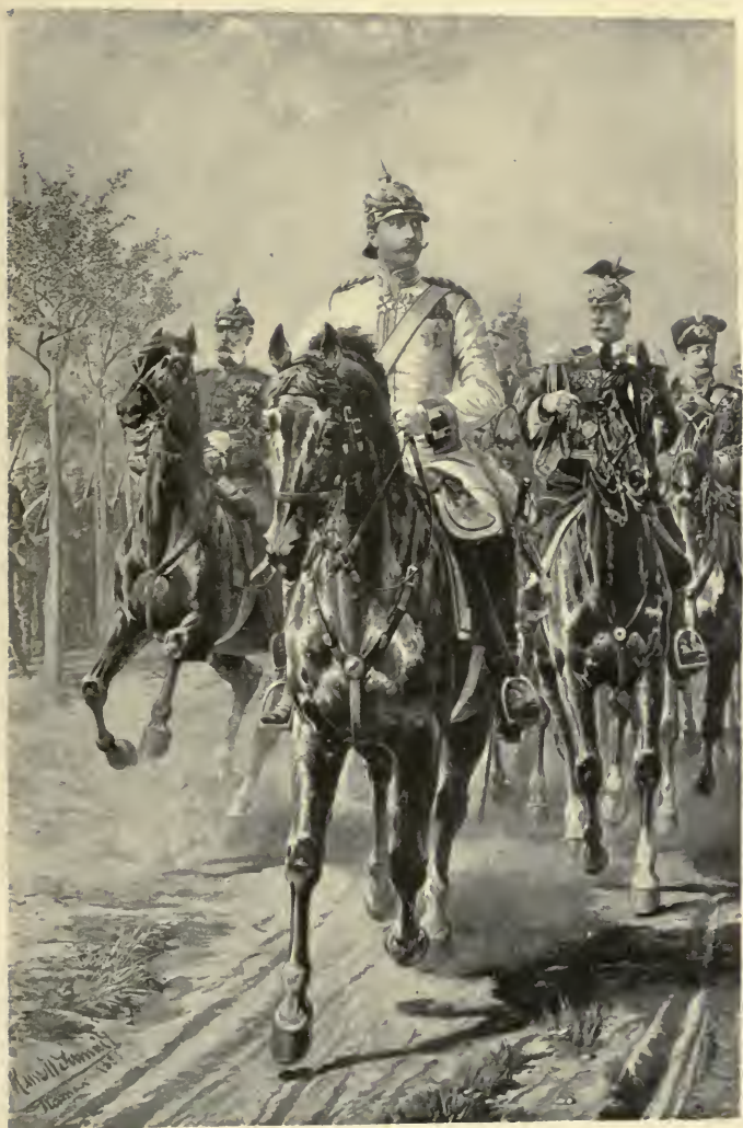
KING WILLIAM II.