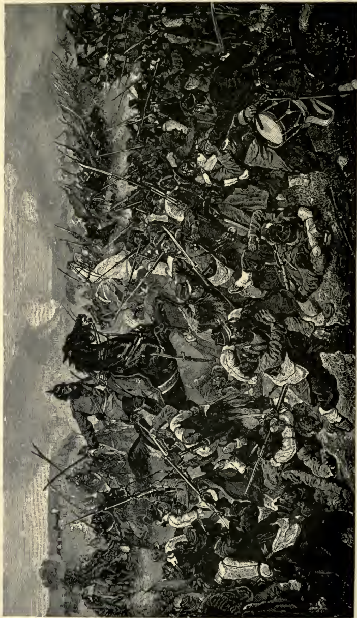
BATTLE OF MARS LA TOUR