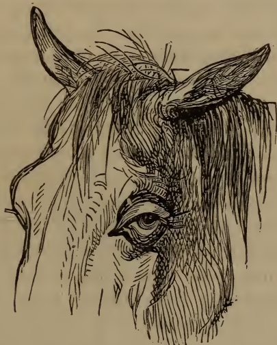
Fig. 6.—SLOW, DULL, OBTUSE.

do this, recourse must be had to such means as will approach as near in principle to it as possible. If the horse be given such freedom as to encourage his confidence in resisting, or if his willful, vicious nature be stimulated by ignorant, abusive treatment, and he should in his excitement and fury resist earnestly, despite of the most severe punishment, it is no more