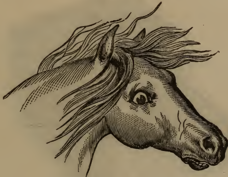
Fig. 3.—WILLFUL AND SPIRITED.

“Third, in relation to teaching the meaning of the sounds or words of command, using the language of Mr. Magner, ‘it is evident that if a man were to sit on