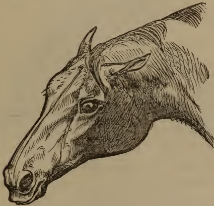
Fig. 1.—HIGHEST TYPE OF INTELLIGENCE.

“Of our domestic animals none occupy more attention than the horse, and altogether there is no subject with which general society is supposed to be more