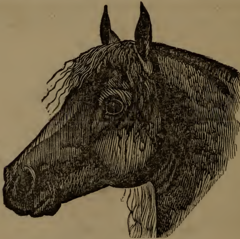
Fig. 4.—DOCILE, KIND, AND INTELLIGENT.