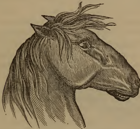
Fig. 2.—VICIOUS AND TREACHEROUS.

“‘Third, it must be appreciated that a horse can not understand the meaning of language or words of command, except so far as he is taught to associate them with actions; consequently, it is not to be ex-