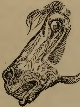
Fig. 7.—VERY EXCITABLE AND INCORRIGIBLE.

greatly; his skin is thin and his blood hot. In Fig. 6 we have a specimen of the heavy, dull, stupid horse; the one that 'any one can drive,' but is rarely driven off a walk, or a very sluggish infrequent 'lope.' He's the horse to try the patience of a saint, when a little behind time for the train. Fig. 7 requires an exceptionally good driver to manage him; he must be watched or some dangerous trick of his may suddenly