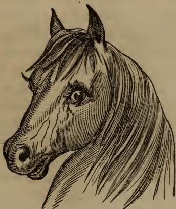
Fig. 5.—EXCITABLE AND OBSTINATE.

to the effect desired. Teaching any kind of trick the principle is the same, the difference being only that instead of a pin other means suitable to the case must be used. To teach tricks by the word would be necessary to repeat the command and associate the act with it. Care should always be taken against confusing or exciting the animal, and but one trick at a time should be impressed upon him, the process being care-