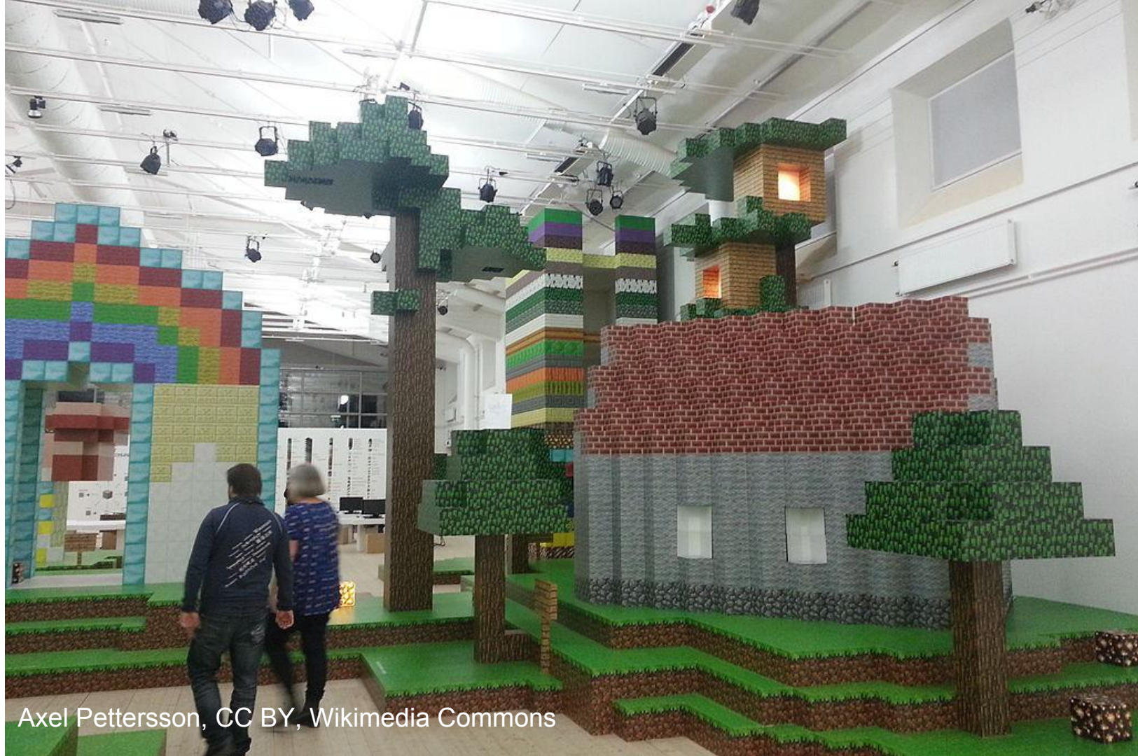
Axel Petterson, CC BY, Wikimedia Commons