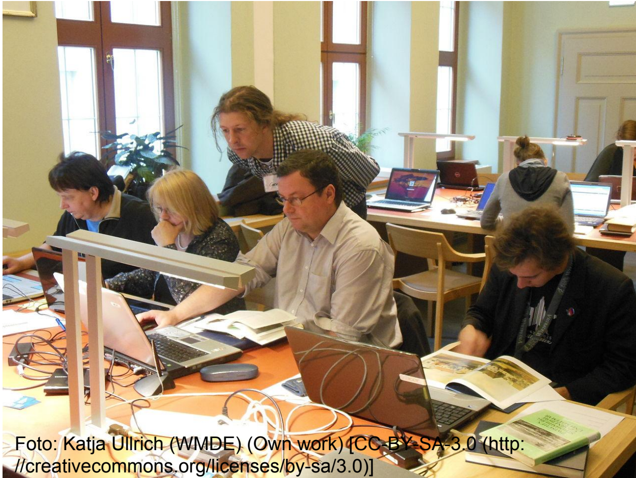
Foto: Katja Ullrich (WMDE) (Own work) [CC-BY-SA-3.0 ( http://creativecommons.org/licenses/by-sa/3.0/ )]