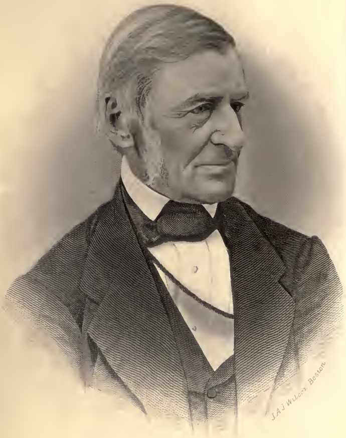
R. Waldo Emerson