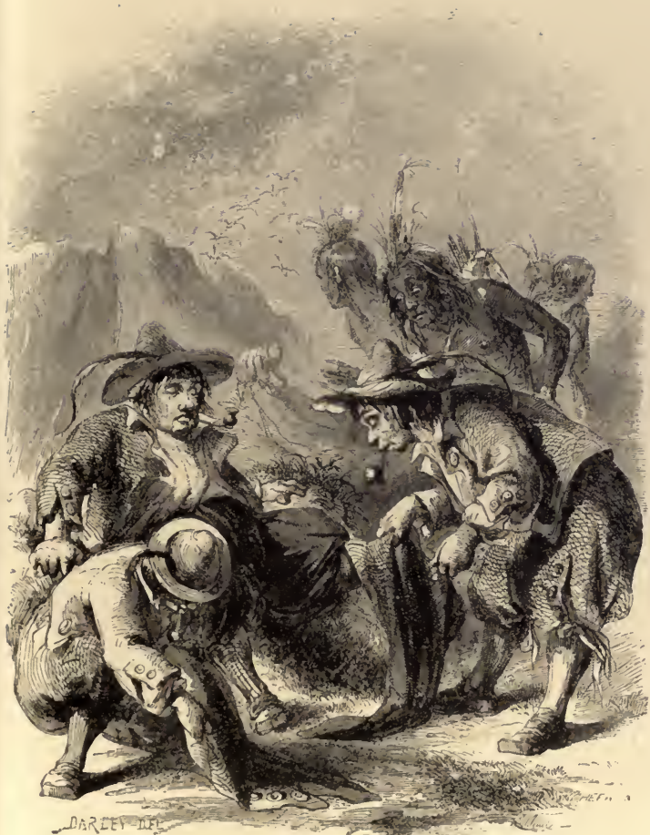
Drawn by F. O. C. Darley.

THE SIMPLE SAVAGES . . . STARED WITH ASTONISHMENT AND DISMAY.